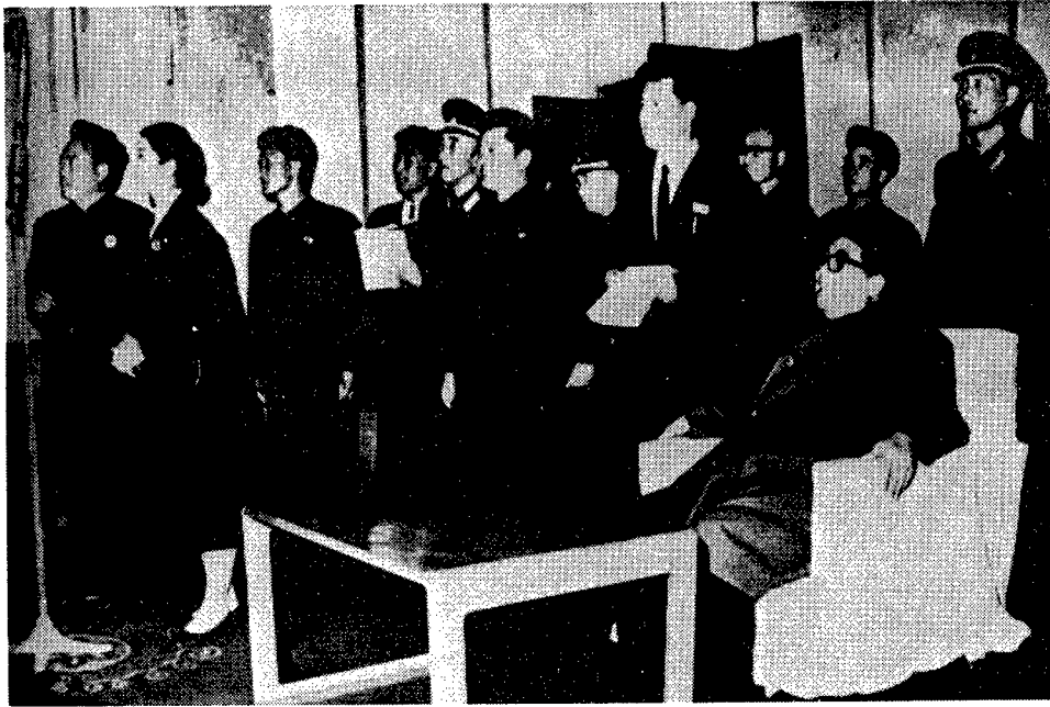
4. Source: "Chosen Hyongmyong Pangmulkwon ha-kwon" [The Korean Museum of Revolution, Vol 2] p 195 (Tokyo: Miraisha)