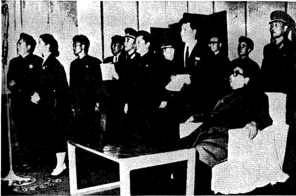
④ 出所 「朝鮮革命博物館下卷」195頁, 東京, 未来社