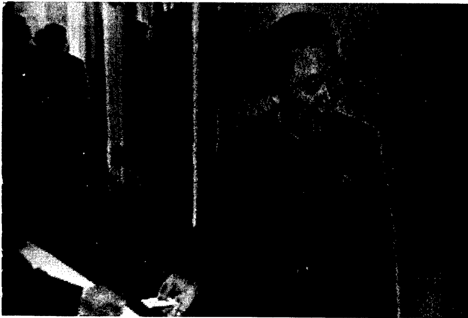
3. Courtesy: Joint Research Institute for International Relations