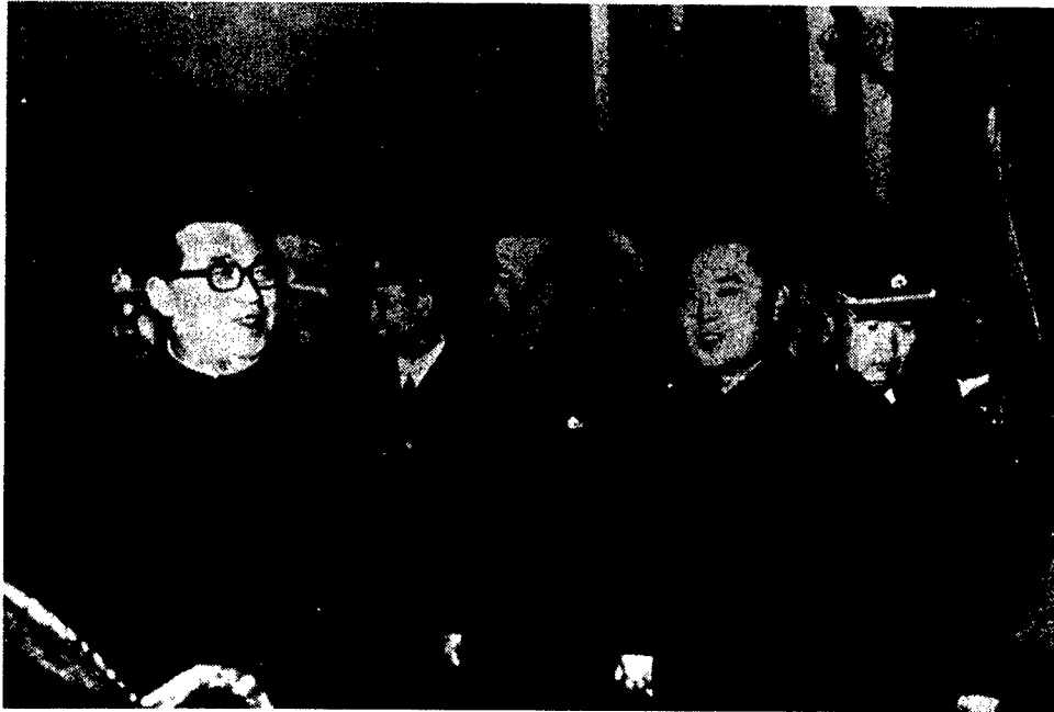
2. Courtesy: Joint Research Institute for International Relations