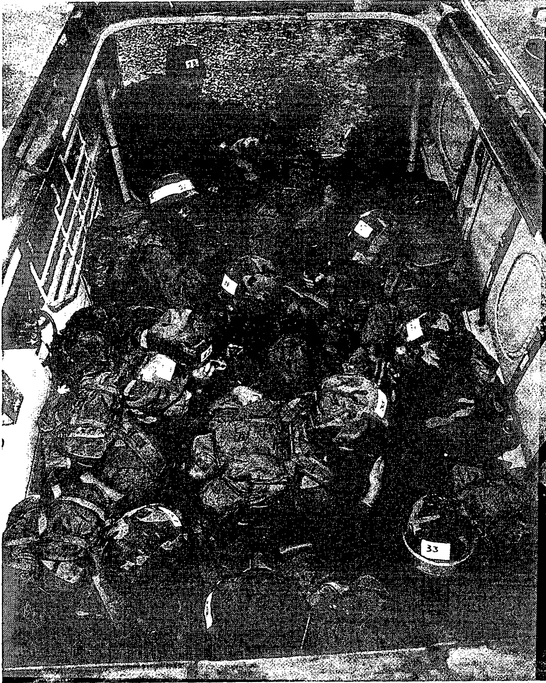
Figure 3. Troop Cargo of the Amphibious Assault Vehicle With 18 Troops With Level 2, Mission Oriented Protective Posture Clothing