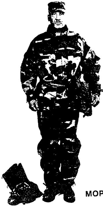
Figure 2. Mission Oriented Protective Posture Clothing