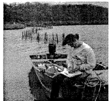
Figure 4. Collecting geomorphology data at the Armand Bayou dredged material marsh in Texas

dredged material marshes with the highest exposure index values had degraded over time, but neither site was suffering from serious erosion problems. This suggests that substantial, permanent structural protection may not be as important as is popularly believed. Considerable savings could be realized if less substantial protective structures are used in site construction,