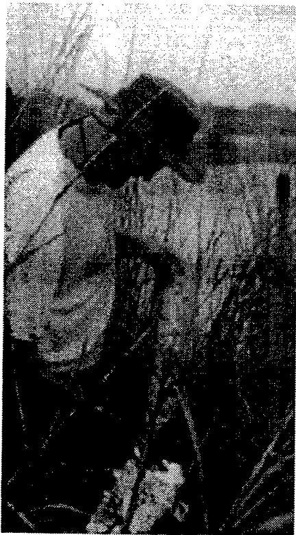
Figure 2. Collecting core sample for belowground biomass measurements in a Texas marsh

statistical analyses may be misused or misinterpreted.