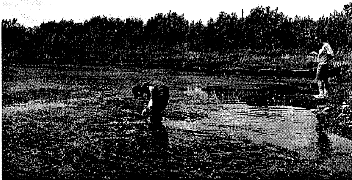
Figure 2. East Lake near Wuhan, China, showing large infestation of submersed vegetation. At first glance, it would appear to be a monoculture, but in fact, it was a mixed assemblage including plants in the genera Potamogeton , Myriophyllum , Najas , Vallisneria , and Ceratophyllum . Hydrilla made up only a minimal portion of the infestation

where the trees are vastly larger, have higher leaf and stand densities, and a large number of seedlings are ubiquitous (Figure 5). Another example is Australian pine where habitat and climatic conditions are similar between its native range (i.e., Australia) and its United States distribution. In its native range, Australian pine is a relatively small tree with only limited number of leaves, and minimal formation of a dense canopy (Figure 6). However, major differences are observed in its growth characteristics in the United States where Australian pine reaches tremendous size, has large number of leaves, and forms a full canopy (Figure 7). These differences in growth are apparently a result of the large herbivore/plant pathogen assemblage impacting it in its native range. 1