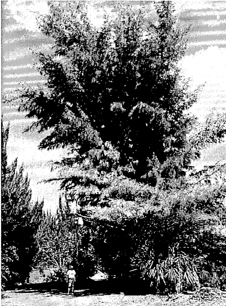
Figure 7. Australian pine located near Fort Lauderdale, FL. Note the large stature of the tree and high amounts of leaves and branches