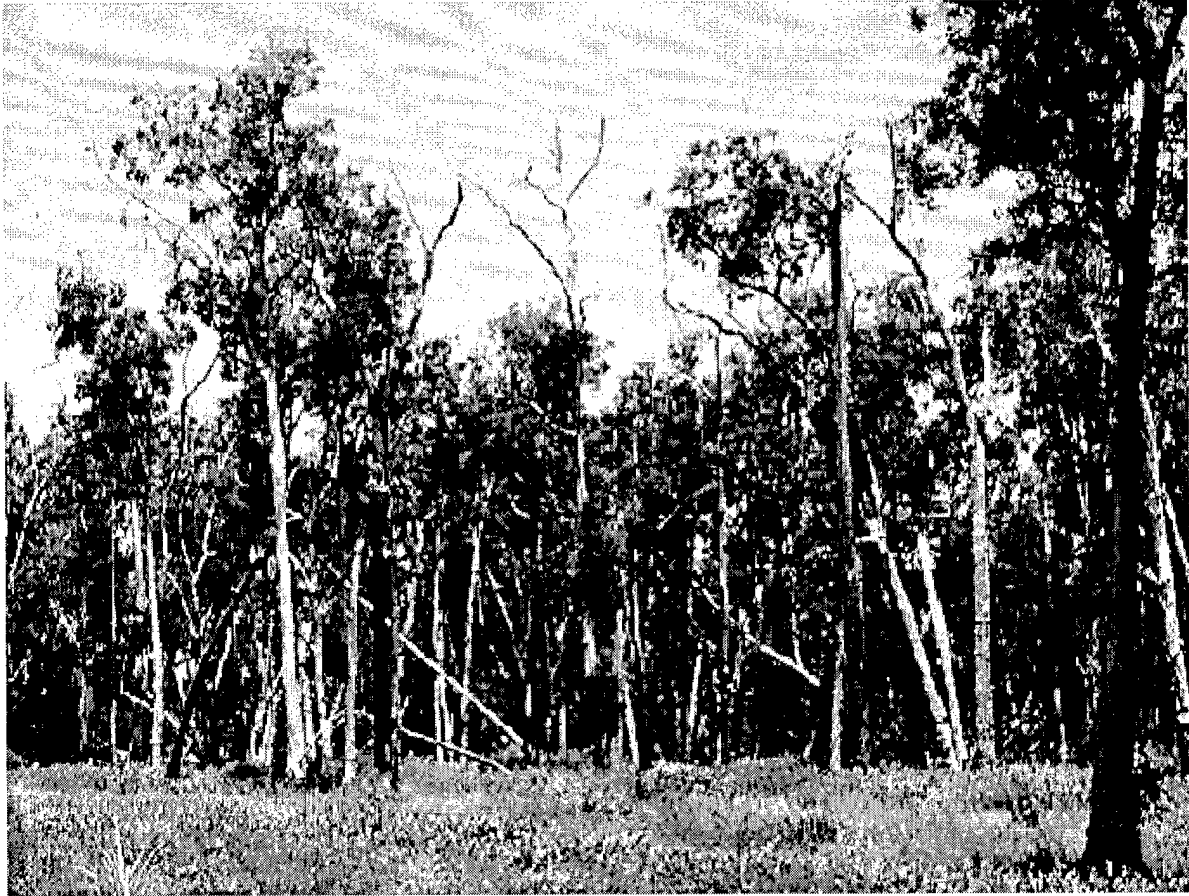
Figure 4. Melaleuca stand near Port Douglas in Queensland, Australia. Note the low density of trees, their minimal size, limited numbers of seedlings, and lack of any significant canopy

Some authors have suggested that invertebrate grazing which results in direct plant mortality is probably the exception rather than the rule (Oksanen 1990; Louda, Keeler, and Holt 1990; Crawley 1989). These authors argue that, in most cases, sustained feeding results in a loss of plant vigor, though not to the extent that significant plant mortality is observed, but rather that the competitive advantage of the damaged plant is decreased. This change in plant competitiveness ultimately leads to changes in plant population size and distribution. Examples of this include waterhyacinth/ Neochetina system (Center 1987, 1994; Center and Van 1989), Canada thistle/ Cassida rubiginosa system (Ang et al. 1994), Hydrilla/ Hydrellia pakistanae system (Van, Wheeler, and Center 1998), Rumex/Gastrophysa viridula system (Bentley and Whittaker 1979), and the Trifolium/Dactylis/Derocerus system (Cottam et al. 1986). In all cases, the apparent impact of invertebrate herbivores on the target species was significantly greater in the presence of a capable plant competitor. To complicate matters further, the amount of plant productivity as influenced by nutrient levels may also influence the impact of herbivory (Oksanen 1990). Oksanen (1990) indicated that in very productive areas, high levels of predators would limit the