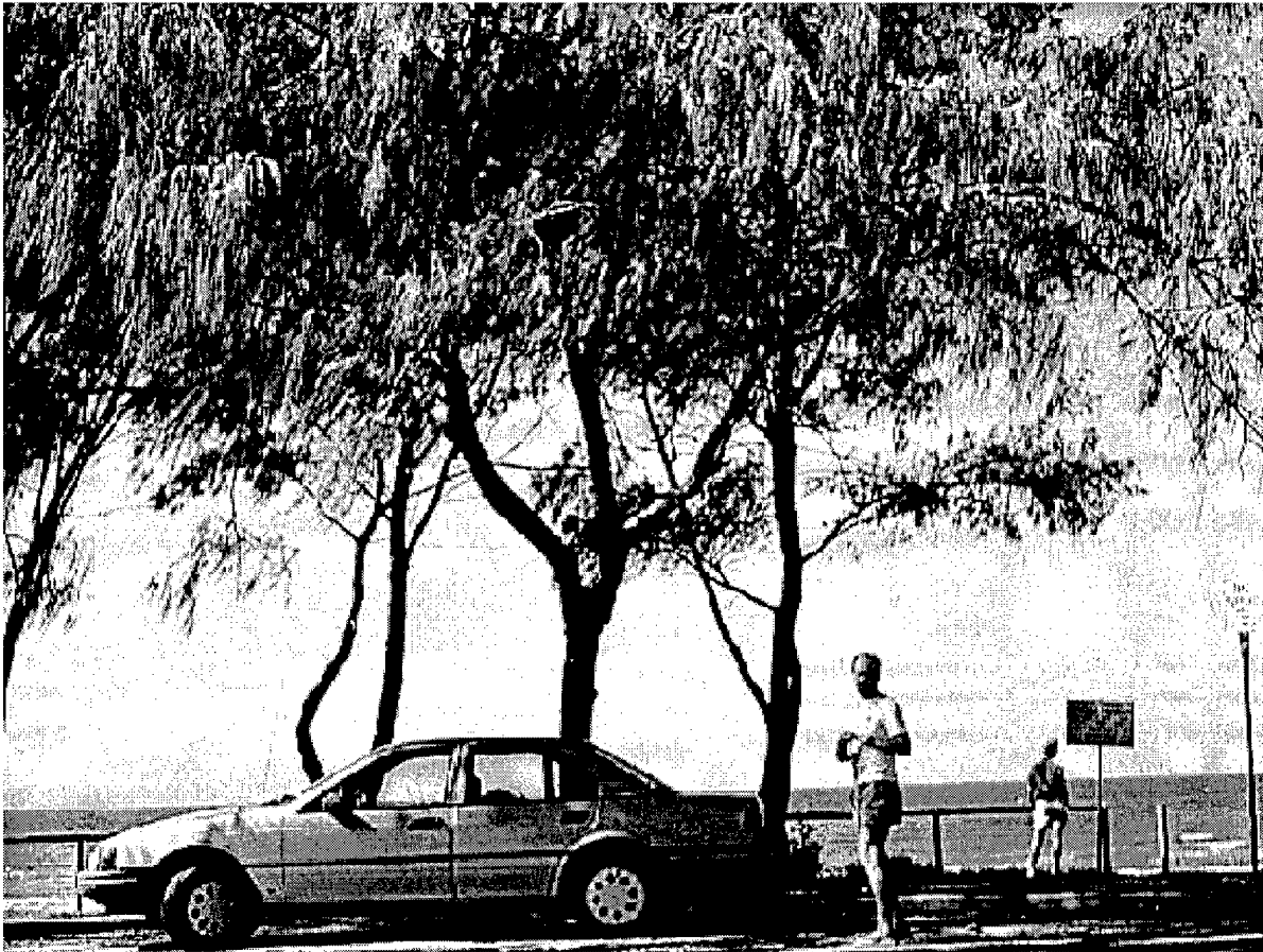
Figure 6. Australian pine near Mission Beach in Queensland, Australia. Note the small size of the tree and minimal amounts of leaves and branches