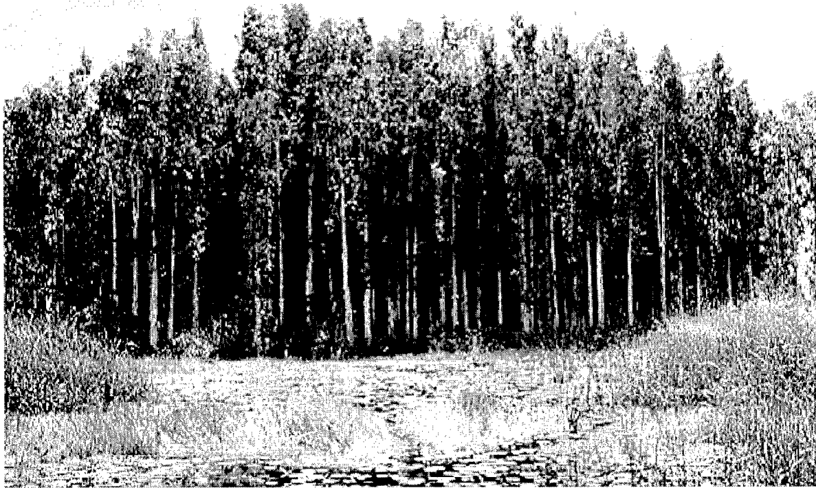
Figure 5. Melaleuca infestation on Lake Okeechobee, Florida. Note the high density of trees, large tree size, wide range of tree ages, and formation of a full and dense canopy

abundance of herbivores, and in barren areas numbers of herbivores would be naturally low and most would occur as transients. The largest impact is predicted in areas with intermediate productivity because the moderate herbivore densities would greatly impact the relatively meager production of vegetation.