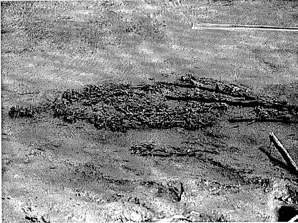
Figure 3. Hydrilla as it typically appears at many areas in its home range in China (near Shenyang). Note that the plants are small and found only in scattered bunches not covering the entire water body

In natural systems, herbivory is largely responsible for keeping plant abundance limited and at reasonable levels (Harley and Forno 1992) and invertebrate grazing, typically by insects, is probably one of the more important regulatory factors (Huffaker et al. 1984). This type of effect, where insect herbivory directly impacts a target species, has long been recognized and forms the basis for the release of host-specific insects for biological control (Harley and Forno 1992). Various published accounts have documented significant impacts by insect herbivores on several exotic weed species, the majority of which are associated with biological control projects (Julien 1987). These include the alligatorweed flea beetle that rapidly impacts alligatorweed, as well as biological control targets of Lantana , Opuntia , and diffuse knapweed. The impact of gypsy moth on various hardwoods across the eastern United States is also well documented (Baker 1972). In many of these cases, insect herbivory impacts plant vigor, which leads directly to declines in the plant population. Herbivory is apparently the main factor responsible for the declines.