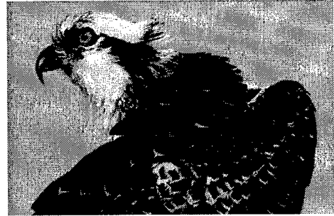
Figure 1. Osprey

The osprey (Figure 1) is one of four raptor species included in a series of Engineer Research and Development Center (ERDC) technical notes produced under the Ecosystem Management and Restoration Research Program (EMRRP). These technical notes (ERDC TN-EMRRP-SI-(12-15)) identify riparian species potentially impacted by U.S. Army Corps of Engineers (Corps) reservoir operations. For management purposes, these raptors are considered riparian generalists because they inhabit riparian zones surrounding streams and lakes on Corps project lands but may seasonally use adjacent transitional and upland habitats. The other raptors in this grouping are the bald eagle ( Haliaeetus leucocephalus ), peregrine falcon ( Falco peregrinus ), and red-shouldered hawk ( Buteo lineatus ), each of which is discussed in a technical note describing the ecology, legal status, potential impacts, and management guidelines for the species. These technical notes are products of the EMRRP work unit entitled "Reservoir Operations - Impacts on Habitats of Target Species" and are linked to ERDC TN-EMRRP-SI-11, which describes the function of the work unit and the general status, impacts, recovery, and management of these four riparian raptors on Corps projects.