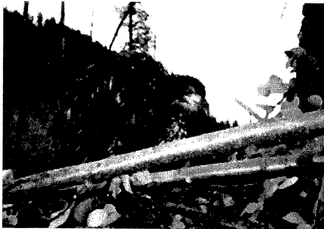
Figure 5. Juvenile bald eagle recovered after its natural nest was destroyed by a storm. The eagle was placed in an artificial nest and eventually fledged (photo by Mark Andreasen, CENWS-OD-LI)

Baltimore District. The first documented eaglet was hatched near the Raystown Lake project Dam in April 1999. It fledged on June 22 and continued to feed in the vicinity of the nest. The Corps played an active role in the protection of this nest through public relations, providing access restrictions, and monitoring eaglet progress and coordination with the Pennsylvania Game Commission. The Corps has worked according to the recovery plan by monitoring winter populations, surveying for nesting eagles, and always evaluating project actions to protect potential nesting habitat.