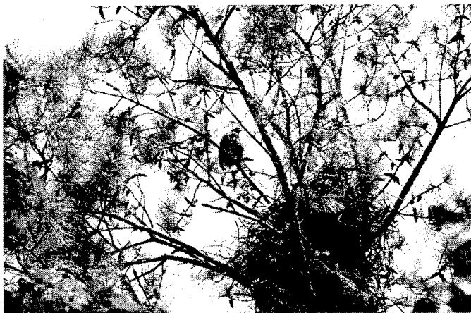
Figure 4. Active bald eagle nest at Okatibbee Lake, Mississippi

The first active nest at Okatibbee Lake, Mississippi, was discovered during the 1996 nesting season. This pair has nested successfully each year since, fledging a total of 5 eaglets (Figure 4). In March 1995, a pair of bald eagles, the first reported nesting bald eagles in northern Georgia, were seen building a nest at Carter's Lake. The pair nested but failed to hatch any eggs. However, this same pair nested successfully the next three years, fledging one young per year. This nesting pair, which now inhabits Carter's Lake year-round, has added five eagles to the population.