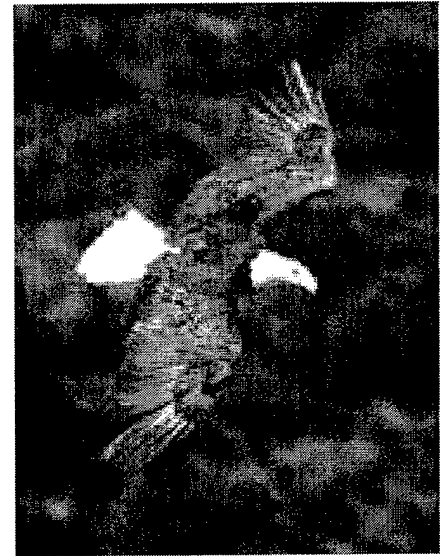
Figure 1. The Corps of Engineers has taken a proactive approach in assisting the recovery of bald eagles

In late 1999, the U.S. Fish and Wildlife Service (USFWS) proposed removing the bald eagle from the Endangered Species List. Recovery of the bald eagle represents one of the greatest accomplishments under the Endangered Species Act (ESA). Also in 1999, the USFWS approached the Department of Defense and requested "success stories" to illustrate the effectiveness of the ESA and to celebrate the delisting of the bald eagle. The purpose of this report is to highlight efforts conducted by the U.S. Army Corps of Engineers in support of bald eagle recovery. Except for background information on current status of the species in North America, information for this report was provided primarily by natural resource managers at Corps project and District offices in response to an informal email survey. This information is not intended to be an exhaustive description and assessment of Corps-wide efforts.