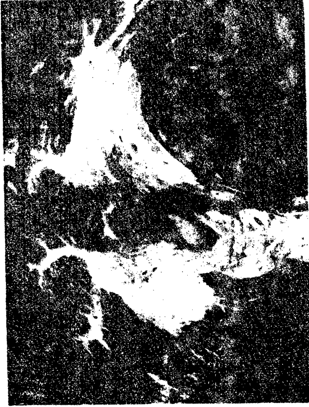
Fig. 1. Neurinoma of the Right Lateral Fontine Cistern. On Transverse Section (View from Eebind), the Tumor with Multiple Cysts and with a Single Large Smooth-Walled Cyst at the Anterior Pole of the Tumor (Dimensions of the Cyst 2.5x 3 cm). The right cerebellar hemisphere and pons are markedly compressed.