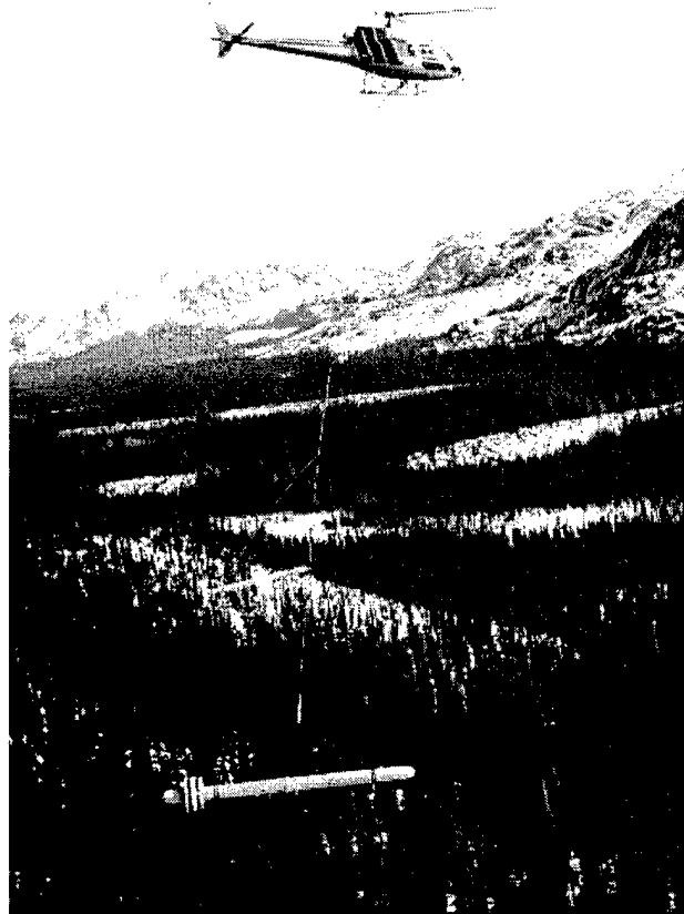
Collecting geophysical information using airborne instrumentation.

This project was initiated in FY93 with a legislative CIP appropriation of $450,000. That amount was in-