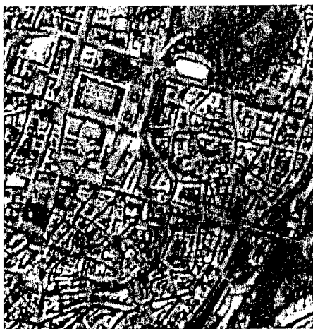
Figure 1: Munich Germany (5m resolution)

For many countries it's far more practical to lease or buy space capabilities from commercial providers or other countries than to develop all the prerequisite infrastructure for an indigenous space program. This is not to imply the U.S. and coalition forces only used dedicated military space systems during Desert Shield and Desert Storm. In fact, they used a great deal of commercial capability, from the French SPOT satellite's multi-spectral imagery to leasing bandwidth from commercial satellite communication systems. 10 What has changed is the quantity, quality and diversity of commercial capabilities now available. For instance, SPOT's best imagery was 10-meter resolution during the Gulf War, meaning a pixel represented a 10 x 10 meter square. 11 Today there are 1-meter resolution systems available. This is not a 10-fold increase, but rather a 100-fold increase: 10-meter resolution has 100 one-meter squares; 1-meter resolution has one. 12 A sample of 5-meter resolution is shown in Figure 1 to compare it to the inherent clarity of the 1-meter resolution shown in Figure 2. 13