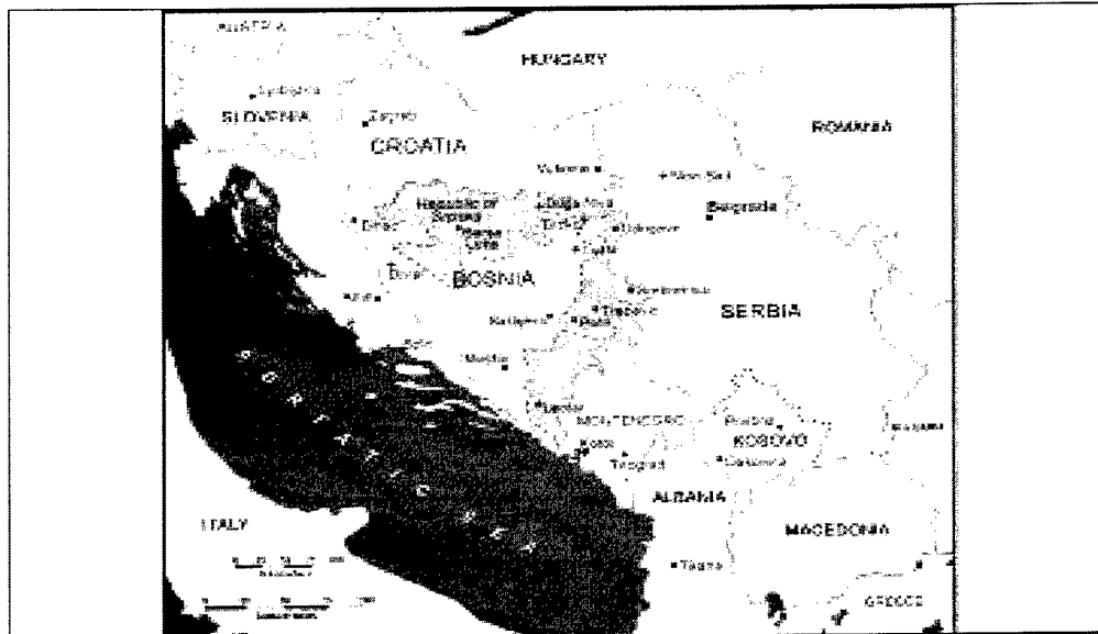
Figure 2. Bosnia, Kosovo, and the Surrounding Region.

Albanians urgently appealed to NATO for assistance, which was provided. Adjacent to Albania is Macedonia, formerly a part of Yugoslavia, but now a free and democratic state. U.S. troops have been on the ground there since 1993 as part of a United Nations (UN) stabilization and security mission, which correctly anticipated the subsequent flow of events. Macedonia, despite the very real centrifugal political forces loosed in the country, managed to hold together during the Kosovo conflict.