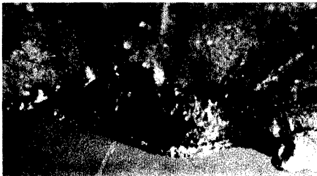
H225-Loss of upper longitudinal speed trim actuator bolt from aft rotor swashplate attaching lug caused by failure to safety upper nut on pin.