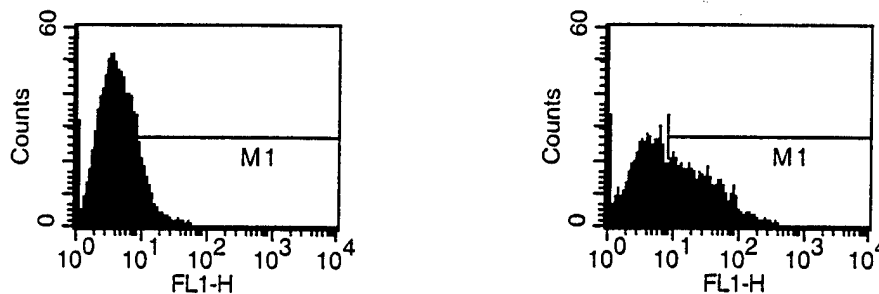
Figure 2: Flow cytometric analysis of HeLa cells uninfected (left panel) or infected (right panel) with VSV packaged MSCV virus. The GFP-expressing population (representing infected cells) is marked as M1. These data represent an example of a single round of infection. Several consecutive rounds of infection can increase the infection rate to up to >90%.

Moreover, we will be able to identify on a single cell basis infected cells using flow cytometric analysis. To generate infectious retroviruses of this packaging-deficient virus, the retroviral plasmid has to be co-transfected with plasmids encoding the envelope, gag, and polymerase genes. We chose to use the envelope gene of the Vesicular Stomatitis Virus (VSV) to generate a highly potent amphitropic virus. In our initial experiments using the epithelial cell line HeLa as target cells for this retrovirus, we observed a 60-90% infection rate (Figure 2). Such high percentages of infected cells will enable us to do the functional studies proposed in our original application. At the moment, we are generating a panel of retroviral vectors containing wild type and mutant forms of SHP-1.