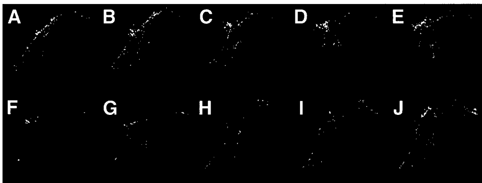
Figure 4. Human mammary epithelial tumor cell transfected with actin-GFP demonstrates filopodial extensions from random sites around the cell. Images were collected at 10-sec intervals from A-J.