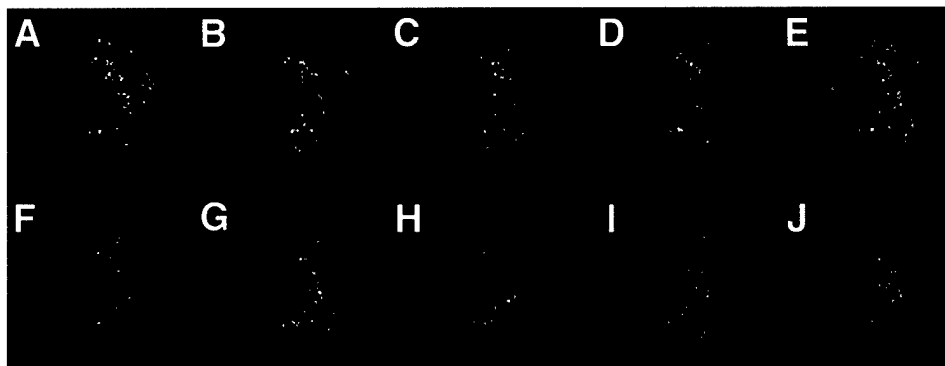
Figure 2. Human mammary epithelial tumor cell transfected with GFP-tagged \beta -catenin. Small foci of \beta -catenin-GFP are seen in the nucleus within 3-4 hours after electroporation. Images were collected at 10-sec intervals, from A-J.