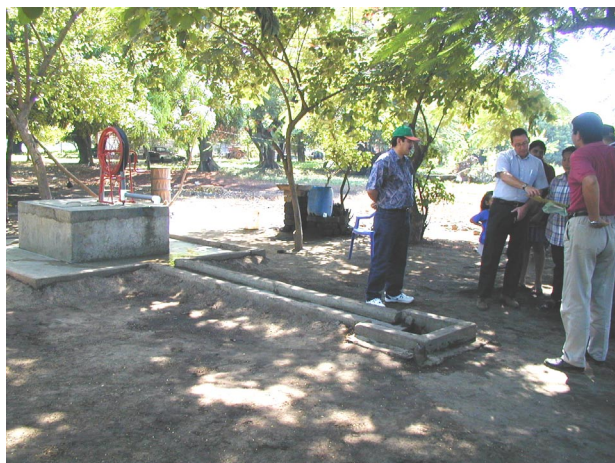
Figure 8: Well Sites in Rural Nicaragua