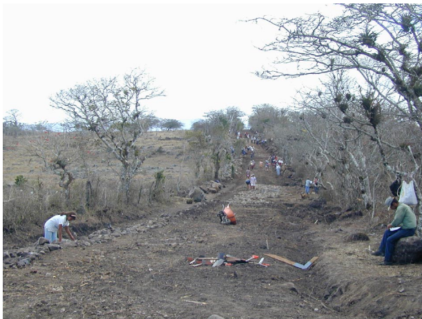
Figure 11: Rural Road Near Jinotega, Nicaragua