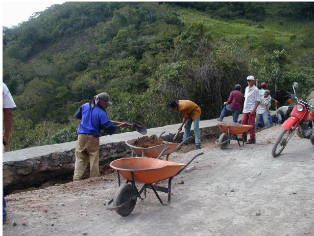
Figure 7: Construction of Retaining Walls and Culverts Near Jinotega, Nicaragua