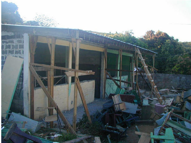
Figure 6: School Under Repair Near La Ceiba, Honduras