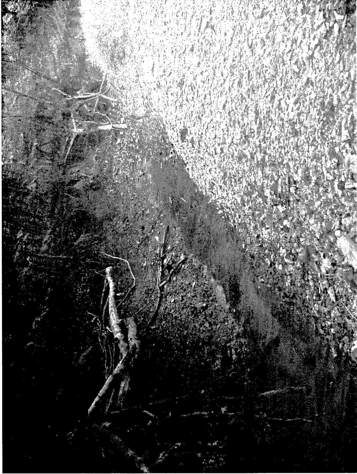
Photograph 2. Upstream view of Site 1 in Cedar Point Branch showing pooled water along cut bank and cobble of dry streambed.