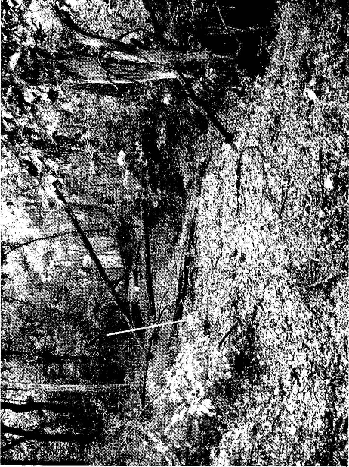
Photograph 10. Downstream view of Site 2 in Woodland Creek showing dry gravel and cobble streambed.