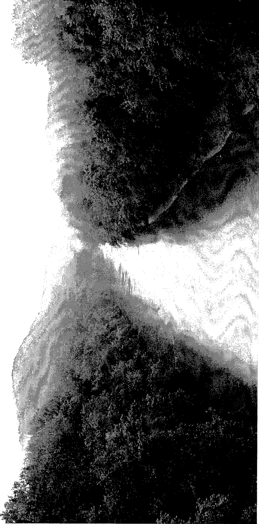
Photograph 1. Upstream view of the Salt River showing rugged terrain along the right descending bank that represents the area drained by Cedar Point Branch.