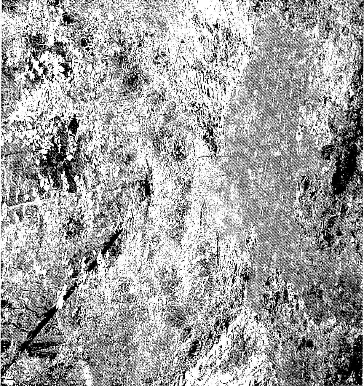
Photograph 13. Downstream view of Site 3 in Mud Creek, a pooled depression in the meandering streambed through a forested alluvial floodplain upstream of Pearl Pond.