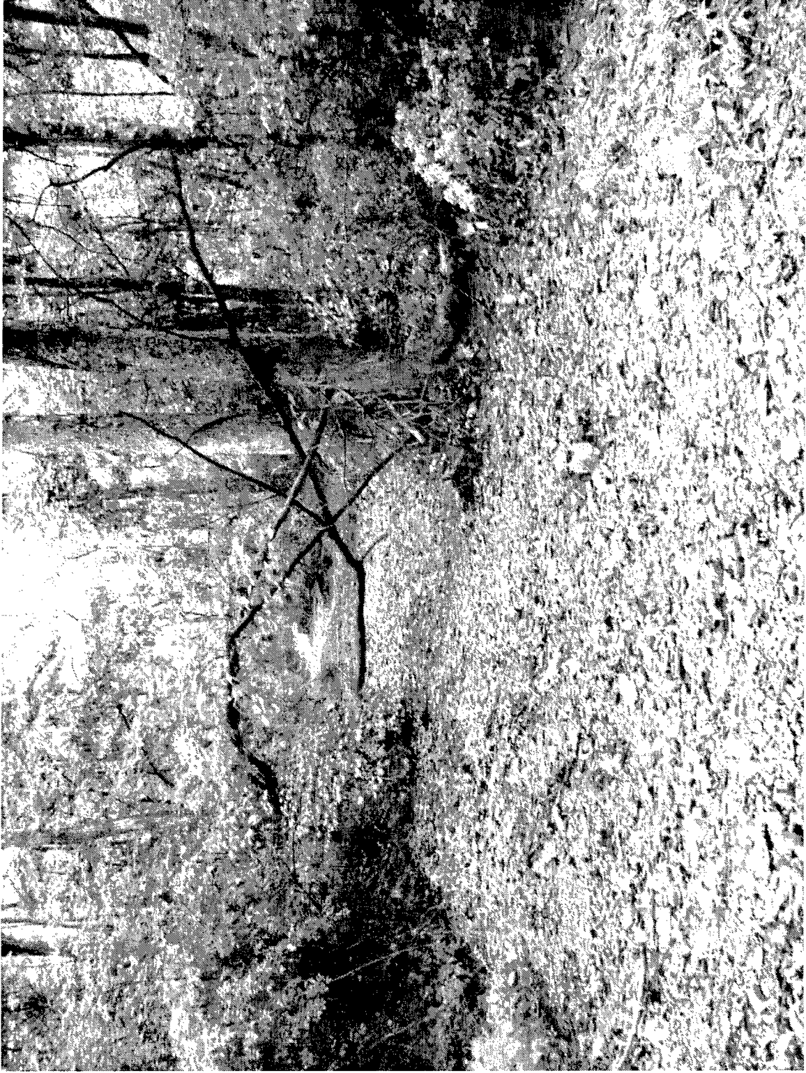
Photograph 9. Upstream view of Site 1 in Woodland Creek showing the dry gravel and cobble streambed and a small scoured depression at the base of a large tree on the left descending bank.