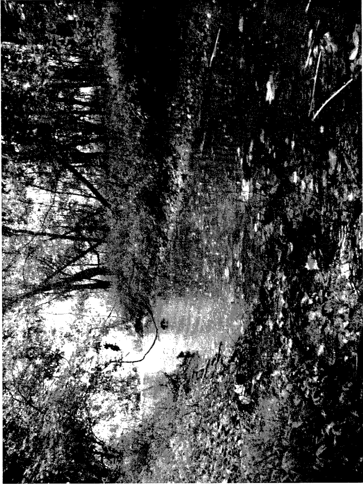
Photograph 8. Downstream view of Site 4 in Castleman Creek with the sunny opening downstream indicating the location of Pitts Point Road.