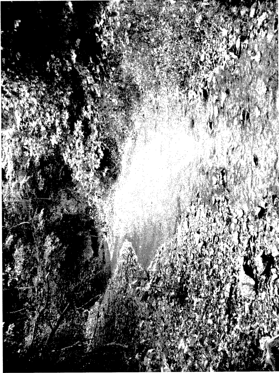
Photograph 6. Upstream view of Site 2 in Castleman Creek.