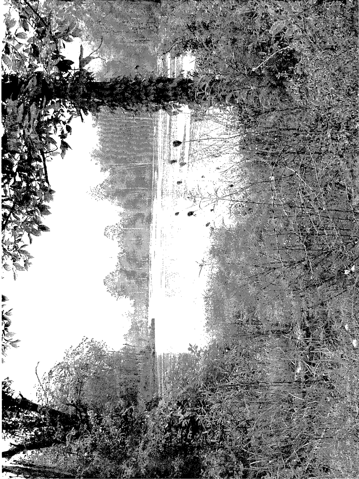
Photograph 16. Upstream view of Wilcox Lake # 3.