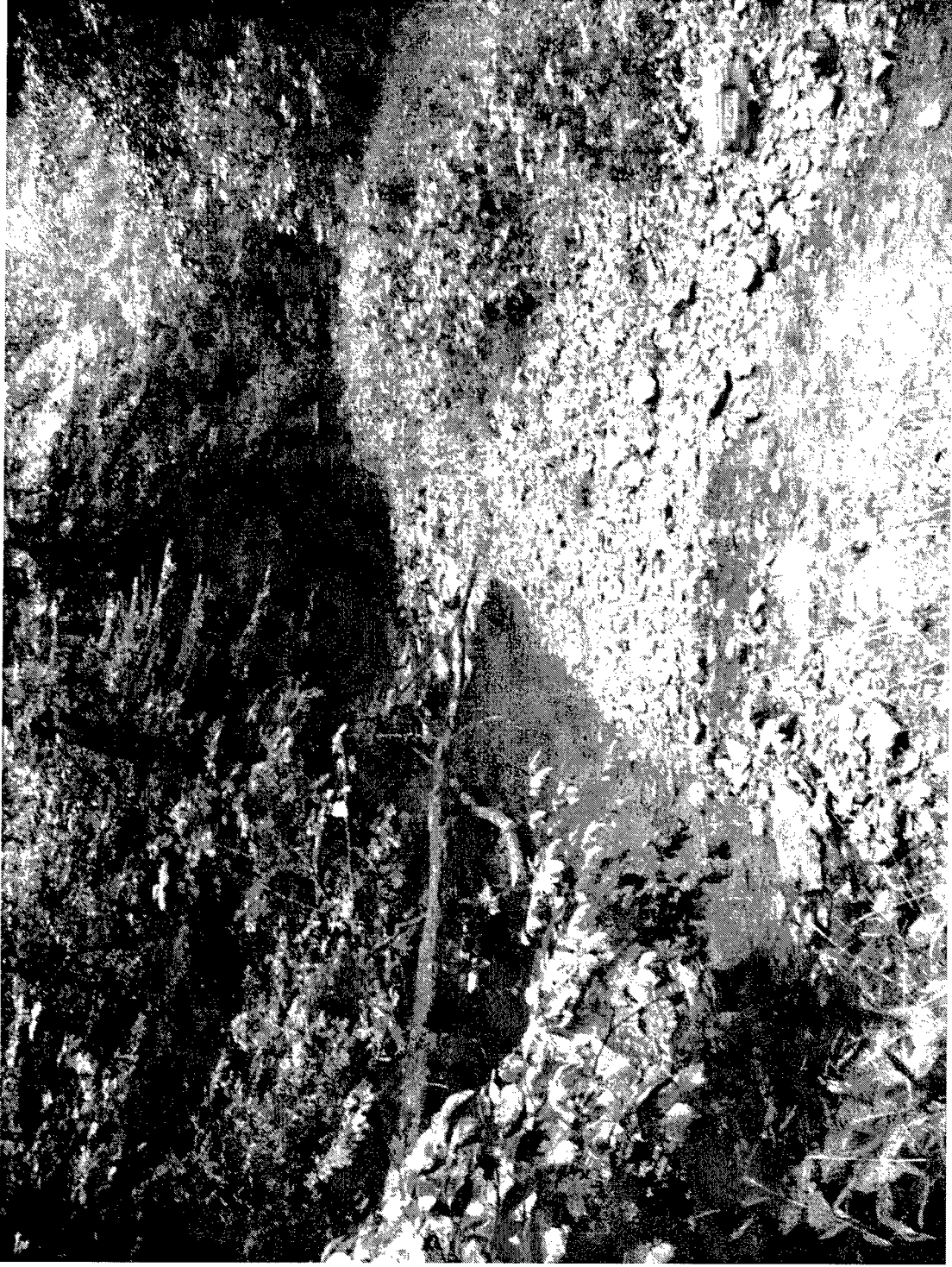
Photograph 7. Downstream view of Site 3 in Castleman Creek showing herbaceous and young woody vegetation growing in dry cobble streambed.