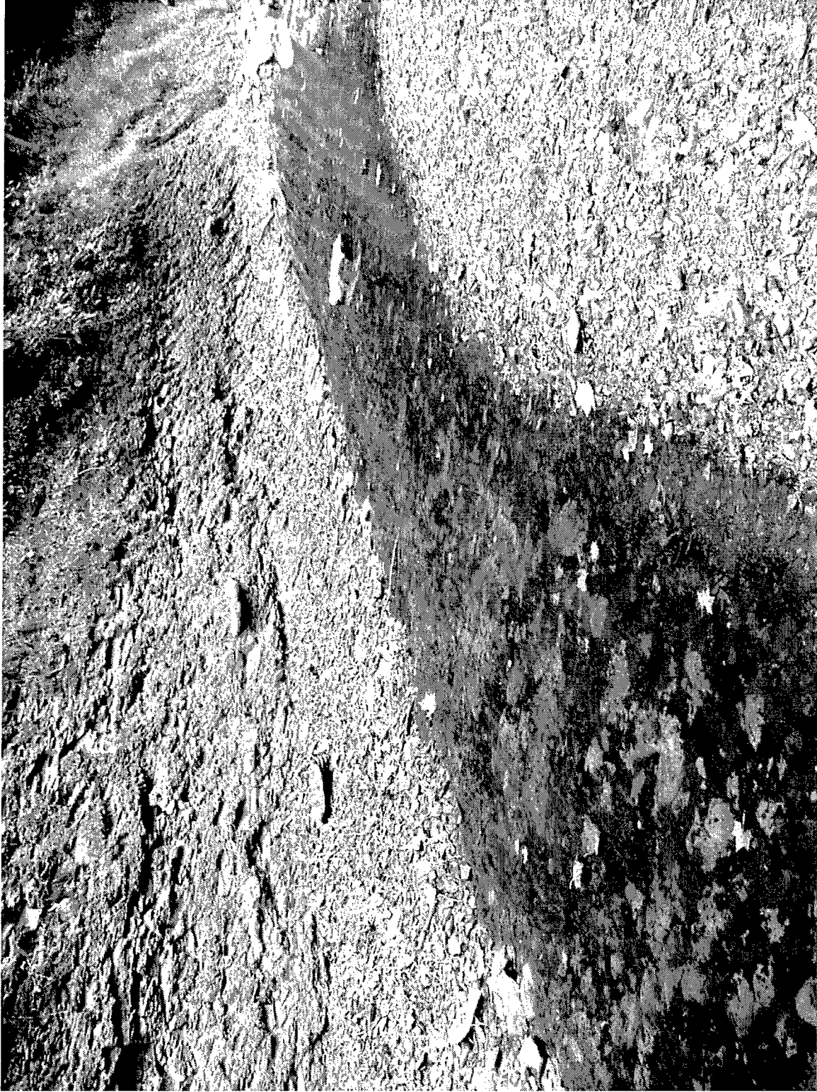
Photograph 3. Downstream view of Site 2 in Cedar Point Branch, a wide and shallow pool along the base of the vertical cliff that forms the left descending bank.