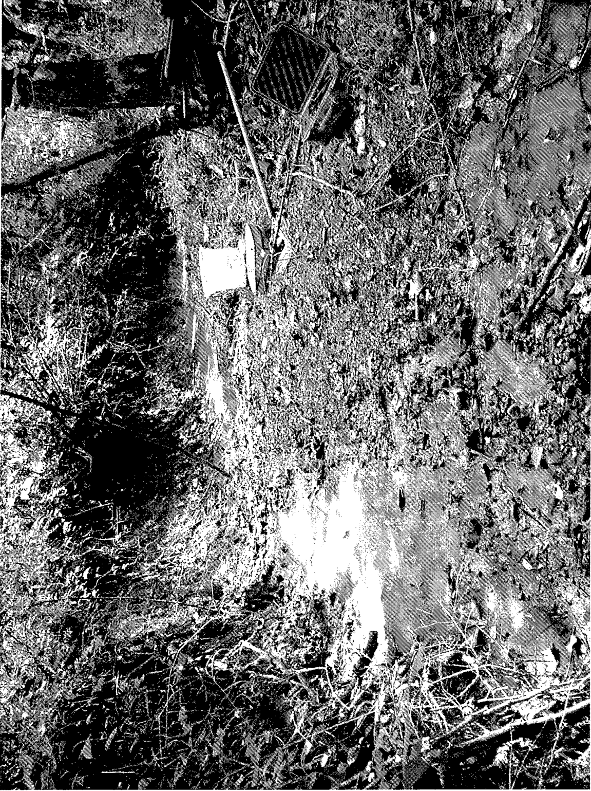
Photograph 11. Downstream view of Site 1 in Mud Creek tributary showing slightly turbid pooled water mainly along the left descending bank.