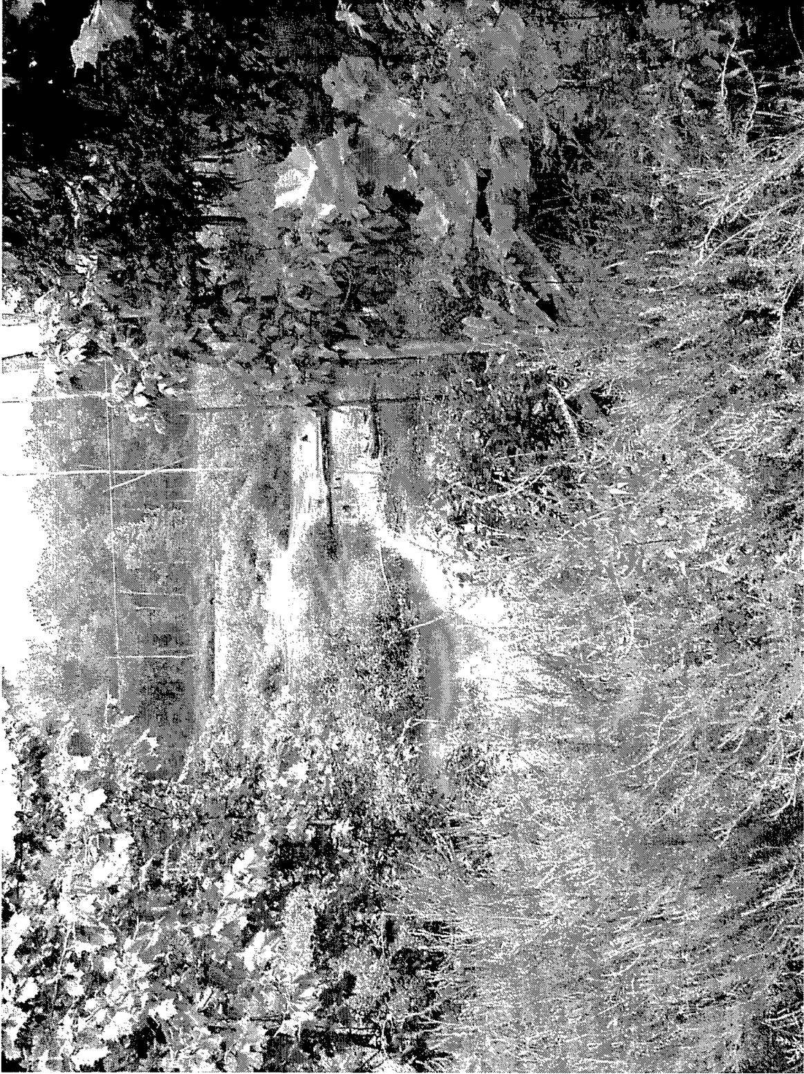
Photograph 14. Pearl Pond on Mud Creek downstream of Pitts Point Road.