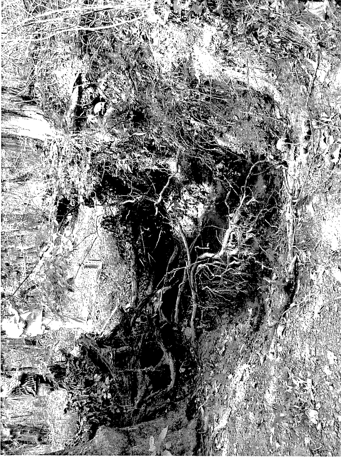
Photograph 12. Upstream view of Site 2 in Mud Creek tributary a pool of water in a scoured area where the stream bends between two large trees on the banks.