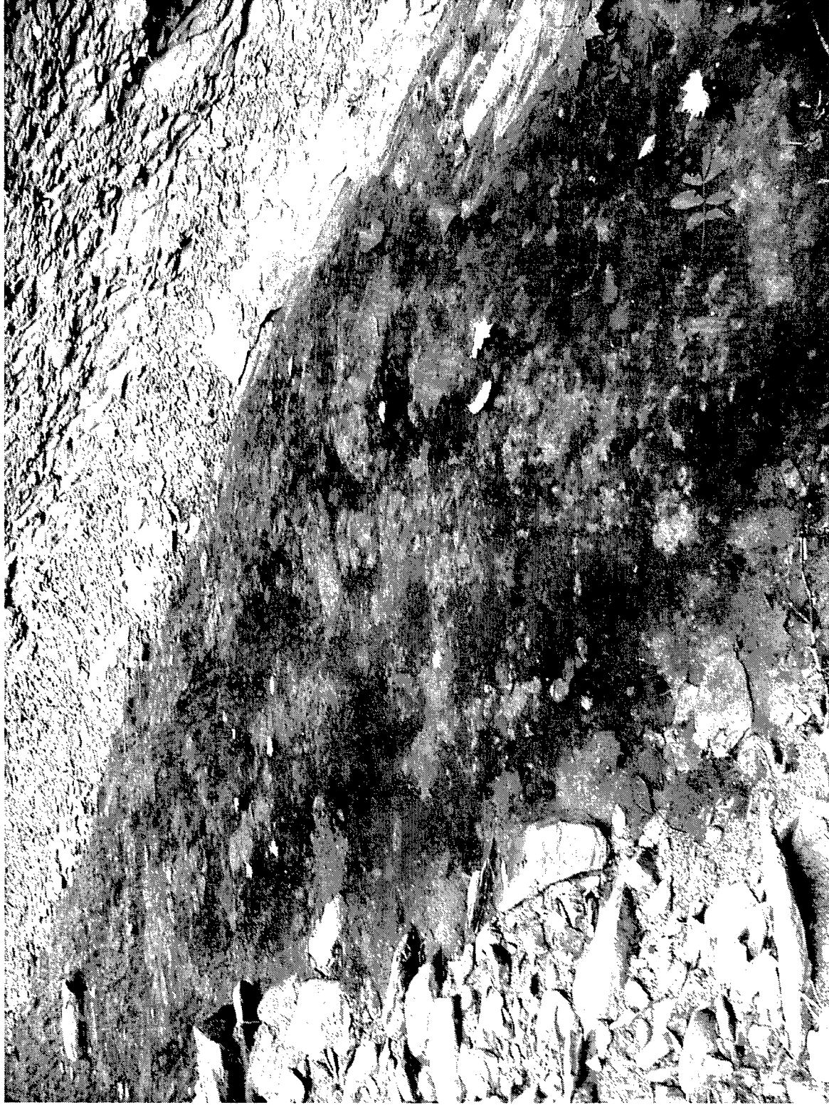
Photograph 4. Fine Particulate organic matter (FPOM) accumulated in Site 2 in Cedar Point Branch.