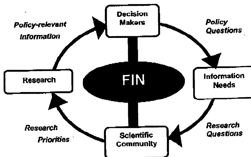
Figure 1. Iterative Process for Developing Policy-Relevant Research Guidance

Though challenging, the purpose of FIN is straightforward: to enhance the use of scientific information by those responsible for managing, restoring and conserving freshwater systems by strengthening the linkages between research and decision making. RAND has designed a multi-phase process that allows freshwater decision makers to convey their information needs to the research community (see Figure 1). After decision makers identified the policy questions and key issues, the research community will identify current or future research to address these needs. Then relevant research guidance will be developed at both the national and regional scale. The results of this iterative process will enhance the dialogue between the research and decision making communities.