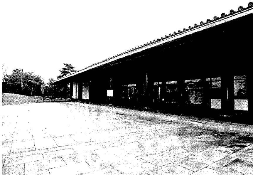
Nara-ken New Public Hall, site of the JAFOE symposium.