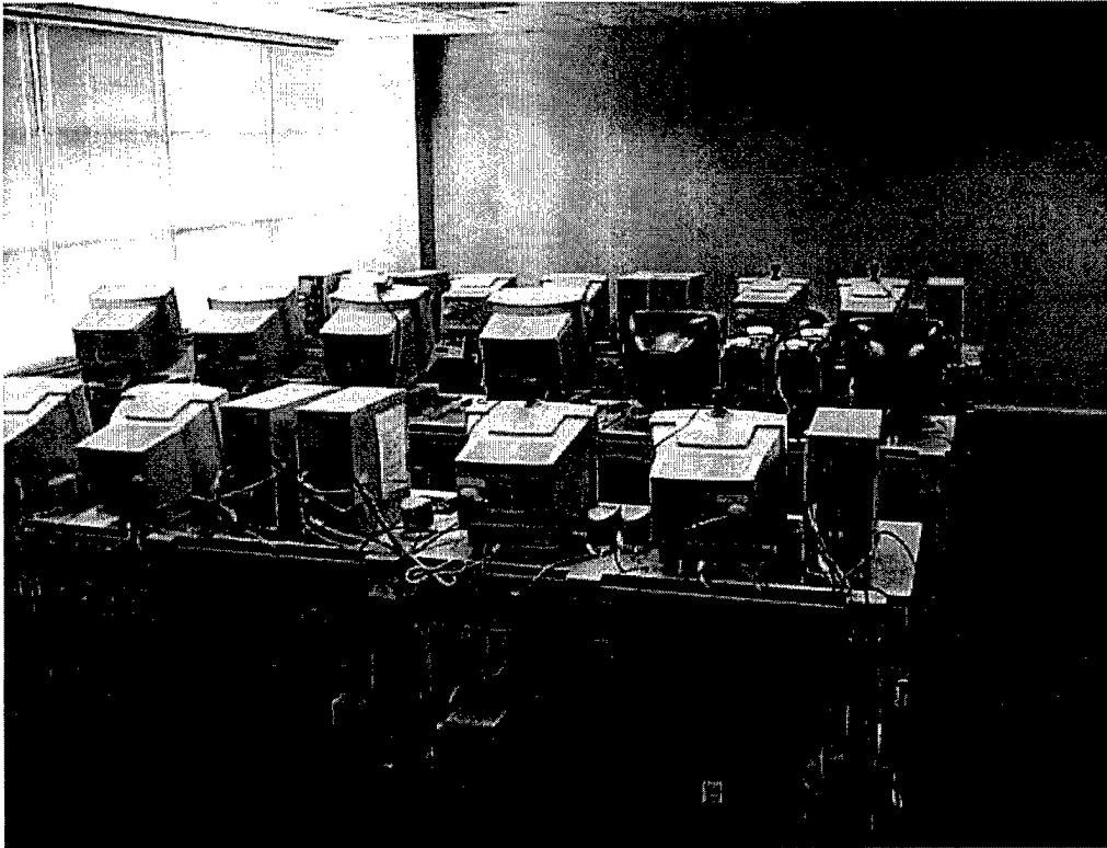
Figure 1.a: Computer Lab Network lab in Room 319 of CTM Building (Left Rows)