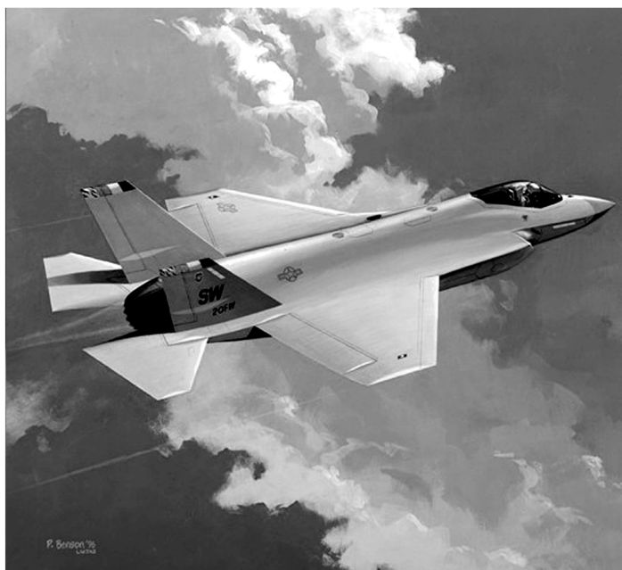
Lockheed Martin Joint Strike Fighter Design Concept