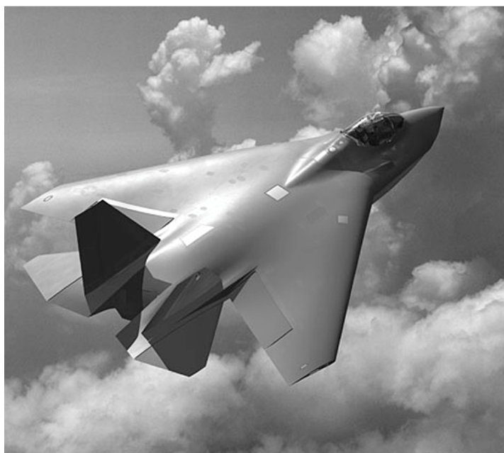
Boeing Joint Strike Fighter Design Concept