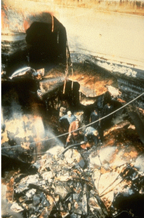
Figure 3 View of torpedo hole below waterline. 42