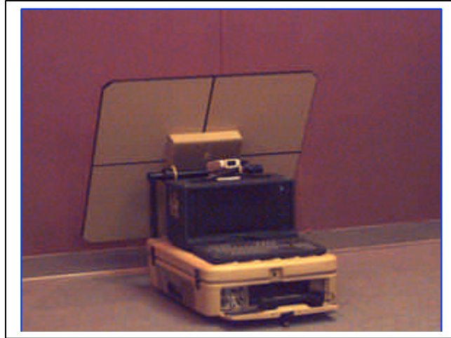
Figure 3. SMART Team Satellite Terminal with Video Teleconference Capability.

Washington; Tripler AMC, Honolulu, Hawaii; and Landstuhl AMC, Landstuhl, Germany. 20