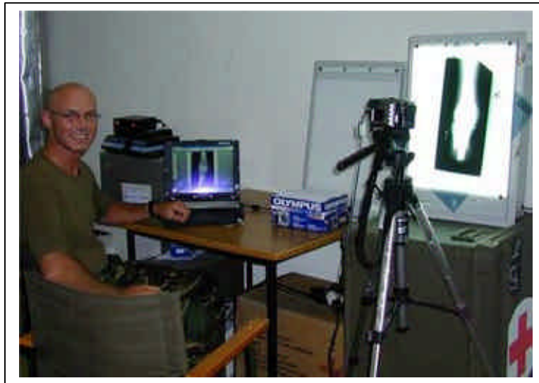
Figure 4. DMS System showing digital camera, viewing box and computer.

Where possible ordinary telephone lines are used to minimize cost, but satellite telephones are used on board ship and in war zones such as Bosnia Herzegovina and Kosovo. 25 Figure 4 shows the DMS system components of the laptop computer, X-ray viewing box and Olympus camera with tripod.