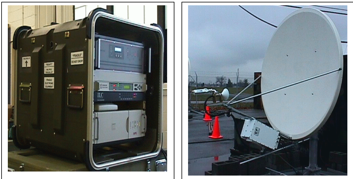
Figure 1. MC3T-VSAT Ground Terminal Equipment and Antenna.

with 1.8 and 3.8 meter dishes available for use if required. 8 Six of the eleven VSAT terminals will be deployed to Bosnia to support military hospitals there, allowing the US Army to use voice, high-speed data, Ethernet and Integrated Services Digital Network services. The system will not only let soldiers in the field send and receive medical data, such as patient records and X-rays, but also let doctors in the field consult with physicians and medical experts in distant medical facilities via teleconferences. 9 Training for the MC3T-VSAT system is conducted as a four-phase course that is sixteen hours long for those with information system experience. The four phases are theory, classroom review of manuals and procedures, hands-on installation, and problem solving and troubleshooting. 10 Figure 1 shows the satellite ground terminal equipment (modem, controller, and multiplexer mounted in a shock mounted transit case) 11 and antenna.