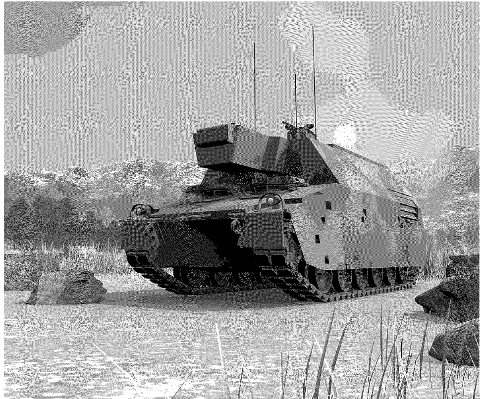
Figure 2: Crusader Tracked Resupply Vehicle