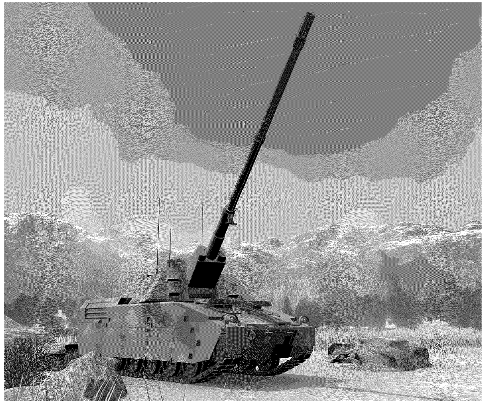
Figure 1: Crusader Howitzer