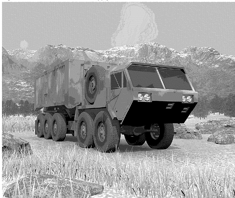
Figure 3: Crusader Wheeled Resupply Vehicle