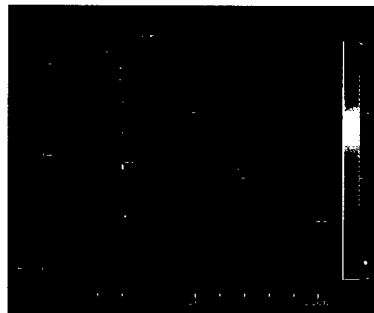
Full-field plume map

less time and with greater resolution than with conventional towed systems. It is a versatile system which has been shown to operate effectively in a variety of environ-