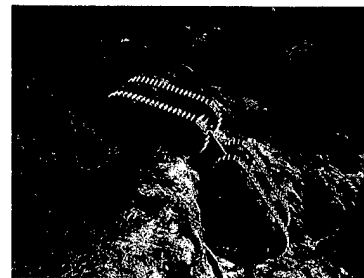
Cooperative mobility concept employing tandem drive for enhanced breaching capability

Following this week-long rescue assist to NYC, attention shifted quickly back to the tactical applications for which the URBOT