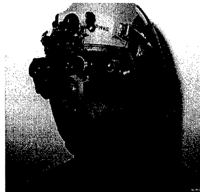
Fig. 1 PNVG Conceptual Working Model

40 degrees. The PNVG's folded optical system resulted in a much better center of gravity compared to the currently fielded AN/AVS-6 and AN/AVS-9 type NVG configuration. Even with the added image intensifier tubes and associated optics, the overall weight of the device was comparable to currently fielded NVGs. The larger FOV and better center of gravity should reduce fatigue effects during long missions and potentially permit the PNVG to be retained upon ejection for use in evasion, escape, and rescue.