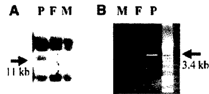
Figure 2. Detection of the NF1 deletion junction fragment. (A) Southern blot of BclI -digested DNA from microdeletion patient 98-1 and his/her healthy parents was probed with a 200 bp PCR product from the breakpoint region of NFIREP-P (AC005562, nucleotides 143567–143766). The arrow indicates the novel 11 kb junction fragment present only in the patient. (B) The deletion junction PCR assay detects a novel 3.4 kb fragment in patient 98-1 but not in his/her healthy parents. F, father; M, mother; P, patient.

To assay this recombination site in other NF1 microdeletion patients, a deletion junction-specific PCR assay was developed. A