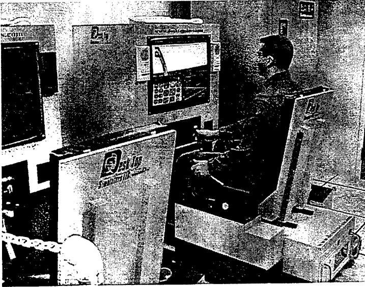
Figure 1. Lateral view of commercial micro-simulator PCATD.