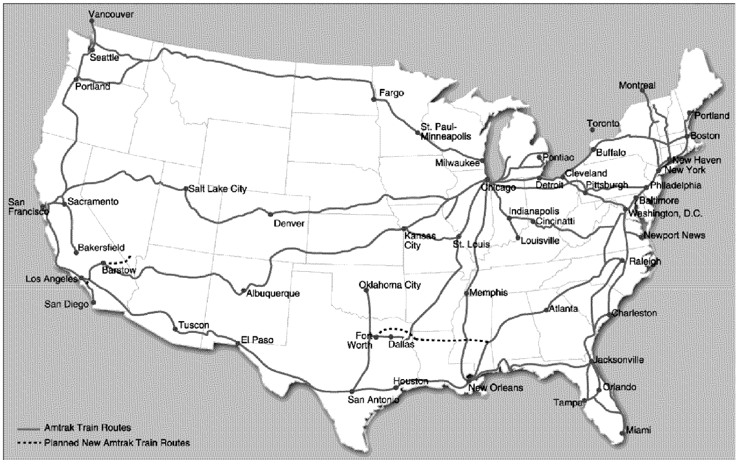
Figure 1: Amtrak's Route System, as of December 2001