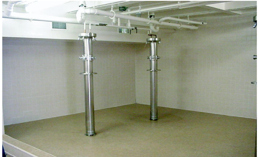
Figure 6: Renovated Showers at Marine Corps Recruit Depot, San Diego