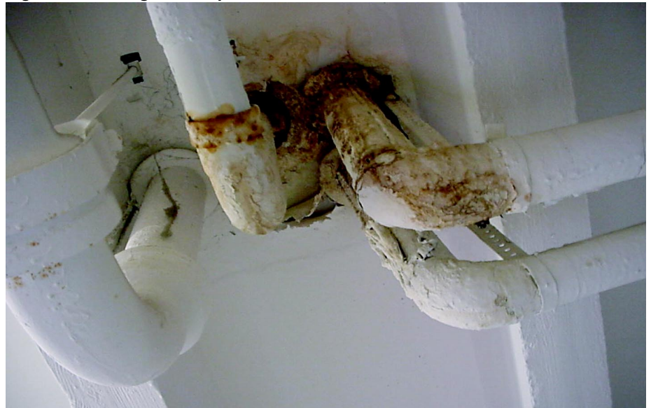
Figure 3: Leaking Drain Pipe at Ft. Knox Recruit Barracks