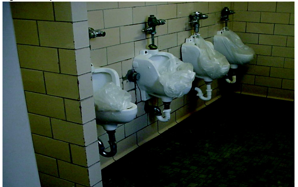
Figure 4: Inoperable Bath Fixtures at Parris Island Recruit Barracks