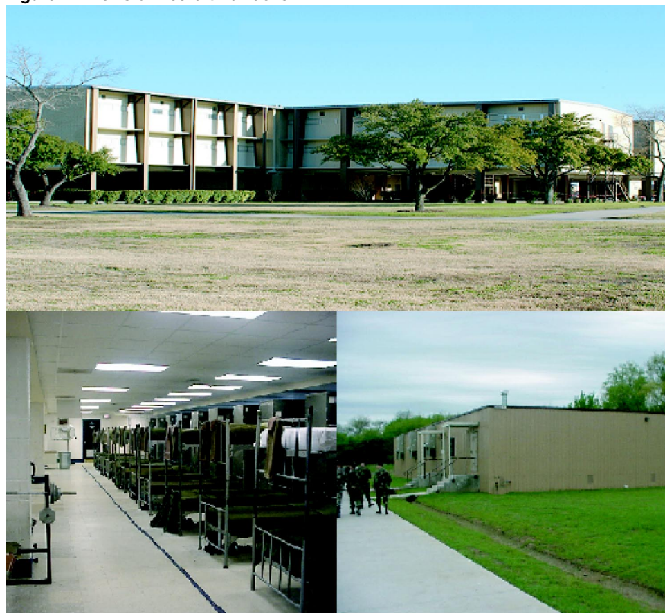
Figure 1: Views of Recruit Barracks

The Army also uses temporary barracks, referred to as “relocatables,” to accommodate recruits at locations where capacity is an issue. Figure 1 depicts an exterior view of recruit barracks at Lackland Air Force Base, Texas, an “open bay” living space at the Marine Corps Recruit Depot at Parris Island, South Carolina, and an Army temporary (relocatable) barracks at Fort Sill, Oklahoma.