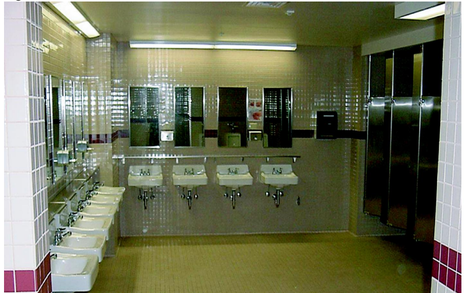
Figure 5: Renovated Recruit Barracks' Bath at Lackland Air Force Base