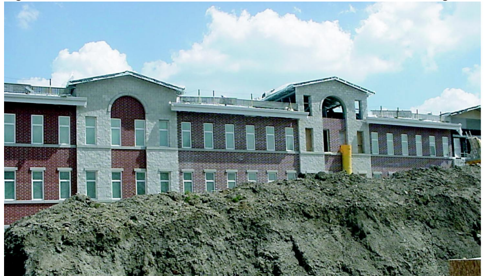
Figure 7: Recruit Barracks under Construction at Great Lakes Naval Training Center

(e.g., providing quality bachelor enlisted quarters and housing for sailors while ships are in homeport) could affect the Navy's recapitalization efforts for recruit barracks.