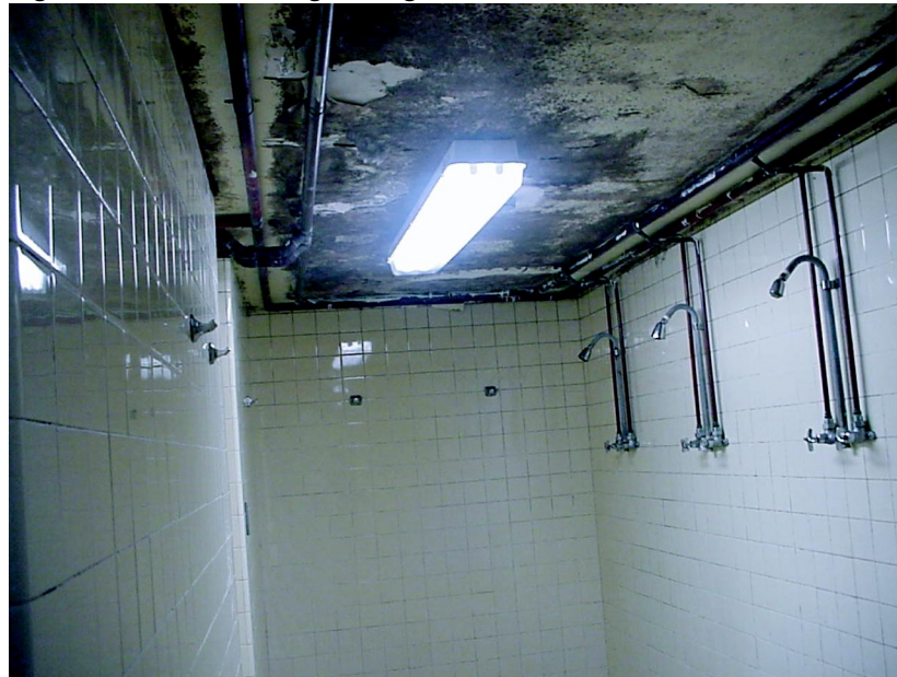
Figure 2: Shower Ceiling Damage at Fort Jackson Recruit Barracks