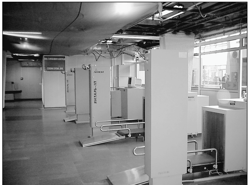
Figure 4: U.S.-Funded Portal Monitors at the Sheremetyevo Airport in Moscow

U.S. assistance includes training, which U.S. and recipient country officials told us is part of an integrated approach that is needed to combat nuclear smuggling. This approach should include equipment, training, and intelligence gathering on smuggling operations. Training is a critical component of combating nuclear smuggling. For example, border personnel need to be trained in inspection techniques, laboratory specialists need to be able to analyze and properly identify material that is detected and law enforcement officials need to be able to conduct investigations in order to prosecute, when appropriate, individuals apprehended in nuclear smuggling cases. U.S. agencies have trained more