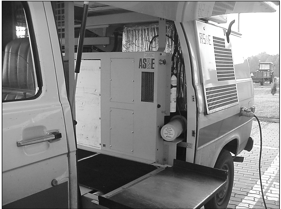
Figure 3: U.S.-Supplied Mobile X-Ray Van

Russian customs officials told us that radiation detection equipment funded by DOE's Second Line of Defense program has helped accelerate Russia's plans to improve border security. According to these officials, as of October 2001, DOE had financed the purchase of about 15 percent of Russia's 300 portal monitors. The U.S.-funded equipment is manufactured in Russia and is subject to site acceptance testing conducted by DOE national laboratory personnel. This testing is designed to ensure that portal monitors are placed in an optimal configuration (to maximize detection capability) and that the equipment is being used as intended. According to Russian officials, there is excellent cooperation with DOE on ways to continually improve the performance of the equipment. Russian customs officials also told us that DOE has done a very credible job of making follow-up visits to inspect the equipment and ensure that it is recalibrated as necessary to meet performance specifications.