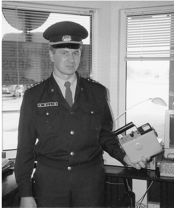
Figure 2: Typical Handheld Radiation Detector Used by Border Guards

In another country we visited, we saw a U.S. Customs Service-furnished mobile x-ray van equipped with a radiation detector being used to inspect luggage and other small items entering the country from Russia. A few hours later, the van was driven to another crossing point along the border where passengers and their possessions were screened at a train station. Passengers' bags and other personal items were passed through an x-ray machine that was part of the van's screening apparatus. Occasionally, the border guard who was operating the x-ray machine would examine the contents of the items that had been x-rayed to determine their exact content. Figure 3 shows the x-ray van.