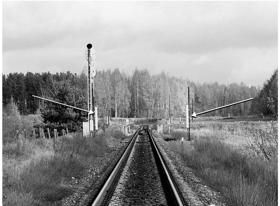
Figure 1: U.S.-Installed Portal Monitors

Note: The arrows indicate the location of the portal monitors.