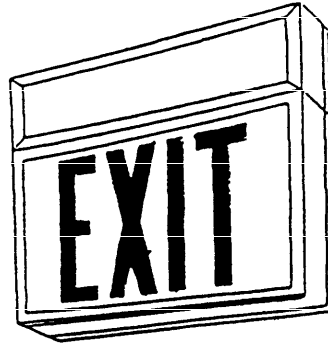
TYPE 604 Stencil Face Exit Signs With Self-Contained Emergency Battery