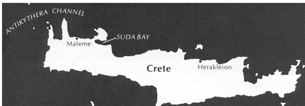
The Island of Crete

Crete is the fifth largest island in the Mediterranean and is approximately 160 miles long with a width ranging between 5 and 35 miles across. The terrain on Crete is extremely rugged. A backbone of barren mountains runs its entire length rising in places to over 8000 feet. Towards the northern coast the slopes are gradual, but to the south they are steep.