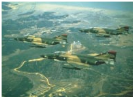
A formation of Vietnam-era F-4 Phantom IIs.

The Vietnam conflict began the change in how airpower planners thought about the use of fighters and heavy bombers. Heavy bombers, the weapons of choice for World War II strategic warfare, were