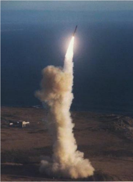
Launch of a Minuteman III.

on JFACC recommendations and the conditions in the JFC's area of responsibility. Apportionment will likely change as the campaign progresses or as the operational situation changes. Early in a campaign the effort may center on counterair and strategic attack. An enemy ground offensive may then necessitate a larger percentage of the total effort be dedicated to close air support (CAS) over strategic attack. If a situation develops that would change target priorities (i.e., Iraq's attack on Khafji), air and space forces can respond almost immediately due to their flexibility.