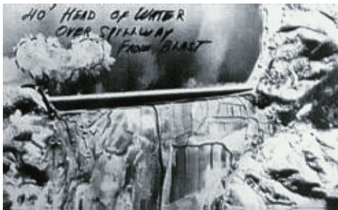
Chasan Dam during (left) and after (below) the May 1953 attacks.