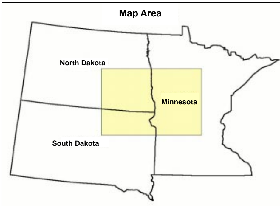
Figure 2. Location of study area.

square miles. A general location map is shown in Figure 2.