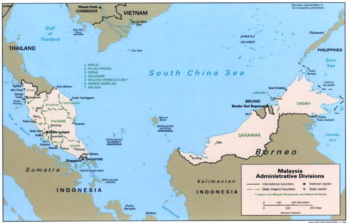
Figure 1. Map of Malaysia

to be discussed later, income and wealth disparity, educational prospects and other disparities emerged between these racial groups, which also contributed to a growing social and economic chasm. These disparities, plus unresolved racial issues, exploded in the form of a bloody communal riot in 1969 that threatened the continued stability and the future development of Malaysia. In response to this turmoil, Malaysian political leaders developed the New Economic Policy with the objective of promoting national unity and stability. The New Economic Policy consisted of the two strategies: to eradicate poverty and restructure the society to eliminate the identification of race with economic functions as a solution to avoiding further civil disorder. Meanwhile, several new issues have emerged which include globalization, a shifting of the political landscape in the country, expectations of the new generations, and the Asian economic crisis and its aftermath.