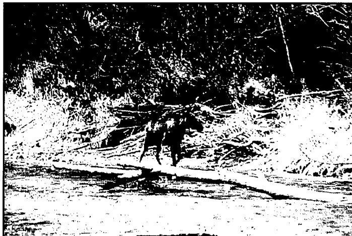
Figure 1. Moose ( Alces alces ) make heavy use of riparian habitats in northern regions

INTRODUCTION: Mammals are an important component of riparian ecosystems throughout the United States, but their occurrence in and dependence on riparian habitats is highly variable. Many mammals use riparian areas for food, water, and cover, especially in the arid and semi-arid western states, but few species are restricted entirely to riparian zones. Several species of large mammals range over vast areas, including upland and riparian ecosystems, but often depend on riparian areas for movement corridors and seasonal cover (Figure 1). Many small- and medium-sized mammals occur in riparian areas, but there is considerable regional variation in use patterns. Western species are attracted to the shade and moisture provided by riparian vegetation, and eastern species especially use riparian areas where surrounding landscapes have been modified by agriculture, logging, and other land uses.