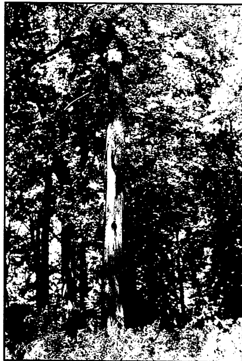
Figure 2. Structural diversity is important to mammals in riparian ecosystems

MAMMALIAN COMMUNITIES: Mammals can have a significant effect on the condition and quality of riparian habitats, but their importance varies regionally. Small mammals (primarily rodents and insectivores) provide an important prey base for larger vertebrates in riparian areas, especially in the West. Large herbivores such as white-tailed deer ( Odocoileus virginianus ) and elk ( Cervus elaphus ) influence forest composition through browsing on woody vegetation. Beaver ( Castor canadensis ) are especially significant in riparian areas