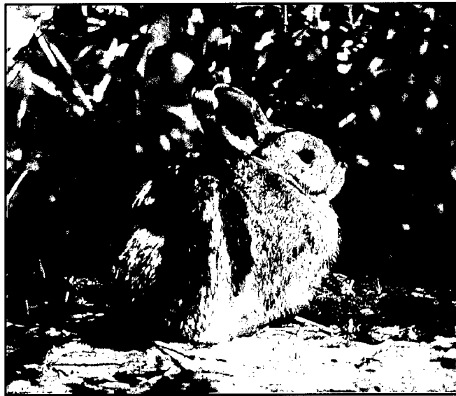
Figure 3. The swamp rabbit ( Sylvilagus aquaticus ) is a characteristic species in bottomland habitats of the Lower Mississippi Valley

Medium-sized mammals with a strong preference for riparian habitats in the eastern United States include the beaver, muskrat, raccoon, river otter, fisher, ermine ( Mustela erminea ), mink, and long-tailed weasel. The eastern cottontail, New England cottontail ( Sylvilagus transitionalis ), and red fox may also be found in riparian areas in the Northeast (DeGraaf and Yamasaki 2000). Species commonly occurring in riparian bottomlands of the Southeast are beaver, muskrat, nutria, raccoon, opossum, bobcat, mink, long-tailed weasel, and swamp rabbit ( S. aquaticus ) (Figure 3).