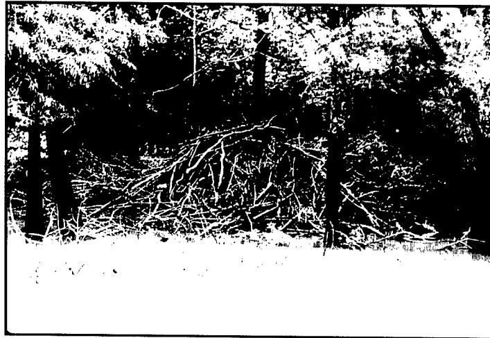
Figure 4. Beaver ( Castor Canadensis ) activity plays a significant role in the development and maintenance of riparian habitat and stream function

Beavers often play a significant role in the development and maintenance of riparian habitat and stream function (Raedeke, Taber, and Paige 1988) (Figure 4). Beaver dams form small lakes within stream systems that can modify conditions in the surrounding forest by creating changes in local hydrologic patterns and nutrient cycling. Created ponds help regulate streamflow during high water and maintain low-water flows, thus enhancing vegetative productivity. Also, habitat alterations resulting from the dam-building and foraging activities of beavers can benefit numerous semi-aquatic and terrestrial species (DeGraaf and Yamasaki