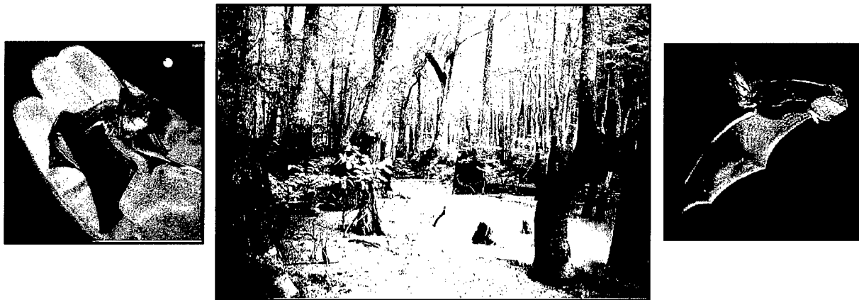
Figure 5. The Southeastern bat ( Myotis austroriparius ) and Rafinesque's big-eared bat ( Corynorhinus rafinesquii ) are species of concern that are highly dependent on riparian areas in the Southeast

Riparian ecosystems provide important habitat for several endangered bat species and species of concern in the East (Figure 5). Maternity colonies of Indiana bats ( Myotis sodalis ) are most often located in floodplain deciduous forests or upland hardwood stands adjacent to riparian or floodplain forests (Garner and Gardner 1992, U.S. Fish and Wildlife Service 1999). Gray bats ( M. grisescens ) forage primarily over water along rivers or lake shores where flying insects are abundant, and summer colonies inhabit areas where streams, lakes, and reservoirs are reasonably close to roosting sites and maternal caves (LaVal, LaVal, and Caire 1977; Brady et al. 1982). Because of the need for surface water and roost sites located near foraging and watering areas, bats may be better indicators of riparian habitat quality than most other mammals. Appendix A, Tables A5-A8 show regional variation in bat species associated with riparian habitats.