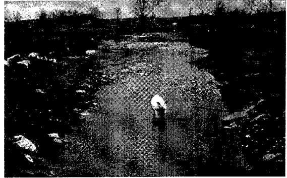
Figure 5. Unlimited animal access to streams increases bank erosion and introduces nutrients and organic matter

IMPLEMENTATION: Watersheds are complex landscapes containing multiple potential sources of materials that can degrade water quality. Understanding linkages between land use, material export, and water quality response is key to designing and implementing an effective watershed management plan. This process will require the acquisition of information describing current conditions in the watershed, the degree of the water resource degradation or potential for impact, and the relative contribution of point and non-point sources to the observed degradation or anticipated impact. Table 4 lists analytical tools and models that are both easy to apply and obtain to assess water quality conditions and to design selected BMPs.