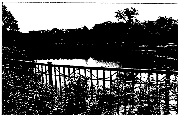
Figure 3. Constructed wetlands and retention ponds, like these in an urban residential area near the Minneapolis Chain of Lakes, MN, can markedly reduce nutrient loading to nearby lakes while providing habitat and aesthetic value

Collecting or controlling runoff offers the opportunity to treat storm waters before they are introduced to water resources. Retaining water in permanent or temporary ponds or retention basins allows for material losses due to increased sedimentation, as well as reduced erosion rates, increased infiltration, and reduced rates of water delivery to receiving streams and wetlands. The creation of wetlands (Figure 3) or the management of existing wetland features, including vegetated riparian strips along water courses or vegetated infiltration features, can greatly reduce runoff rates while retaining significant quantities of nutrients and sediments.