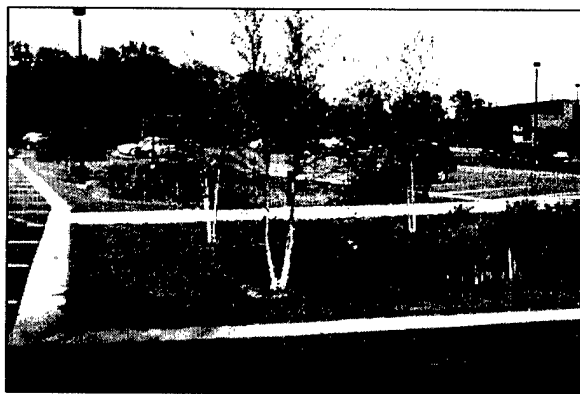
Figure 2. Parking lot designs that limit curbing and incorporate pervious infiltration areas reduce storm water runoff volume and the export of materials to nearby streams

Commonly employed BMPs for urban and residential watersheds are listed and briefly described in Table 2.