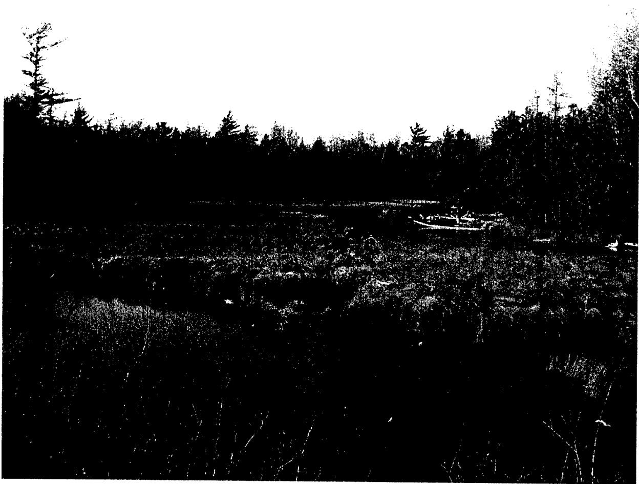
Figure 1. Riparian buffer strips provide numerous physical and ecological functions. Corps of Engineers Regulatory personnel should consider these functions when reviewing permitting decisions potentially affecting rivers, streams, and other aquatic systems (photograph of the Crystal River, Michigan)

The objective of this technical note is to identify technical and scientific considerations regarding upland and riparian buffer strips. Criteria for buffer strip designs are presented that can be considered when assessing the impacts of a proposed development on aquatic systems. Information for this report was primarily developed under the Corps' Ecosystem Management and Restoration Research Program (EMRRP).