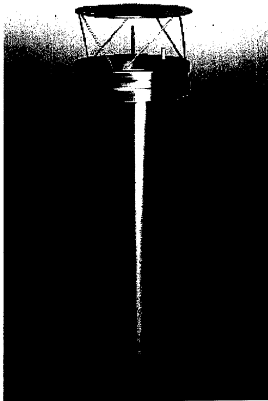
Figure 1. Front view of the Cossonay 500-C-M digital thermal anemometer and meteorological sensor. The sensor shown here has 3 platinum hot films mounted on a small ceramic tube installed vertically on the instrument head and is surrounded by a protective wire cage.

ARL's Robotics Systems Integration Team is investigating robotics designs, which include the implementation of data display and sensor systems as part of the Army's command and control architecture. Compact packaging is important. Therefore, one of the components being evaluated for an all-terrain robotics systems platform is the Cossonay 1 Model 500-C-M precision thermal anemometer and meteorological sensor. The Model 500-C-M sensor is compact, automatic, and self-contained with no moving parts (fig. 1). The Model 500-C-M is a patented, solid-state instrument that provides continuous digital (RS232) signal output and operates from a 12v DC power supply. The meteorological components, microprocessor, and electronics are enclosed in a sealed weatherproof casing. The sensor height, head width, body diameter, and total weight are 255 mm, 90 mm and 70 mm, and 1.5 kg, respectively. The Cossonay 500-C-M sensor measures wind speeds from 0 to 40 m/s (threshold 0.3 m/s), wind direction over 360°, air temperature from -40 to +60 °C (resolution 0.1 °C), and air pressure from 600 to 1200 mbar.