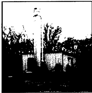
Packed Tower (air stripping)

Air stripping is the mass transfer of compounds from an aqueous stream to a gaseous stream. Air stripping is used to