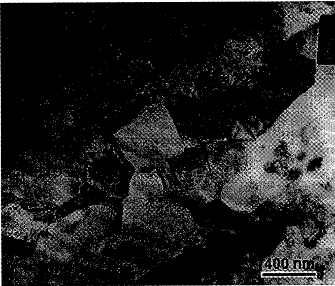
Fig. 2 Microstructure of the cryomilled Al-7.5%Mg alloy.