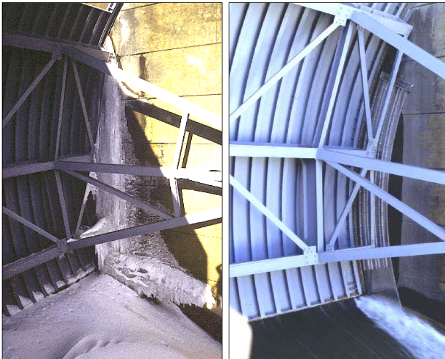
Figure 1. Icing on a tainter gate at Gavins Point project, Yankton, South Dakota, prior to heater panel installation (left) and after installation on the pier wall (right) showing the panel's outer covering removed. (Parallel white lines are troughs for the heater tracing.)

Placing side-seal rub plate heaters that have replaceable electric elements on dam gates was beneficial, but the limited area that was heated did not entirely prevent the gates from freezing shut. For example, Figure 1 shows ice accumulation on the downstream side of a tainter gate at the Gavins Point project in Yankton, South Dakota. These gates have heaters to prevent the side seal from freezing to the steel rub plate. However, because the surrounding concrete is a poor