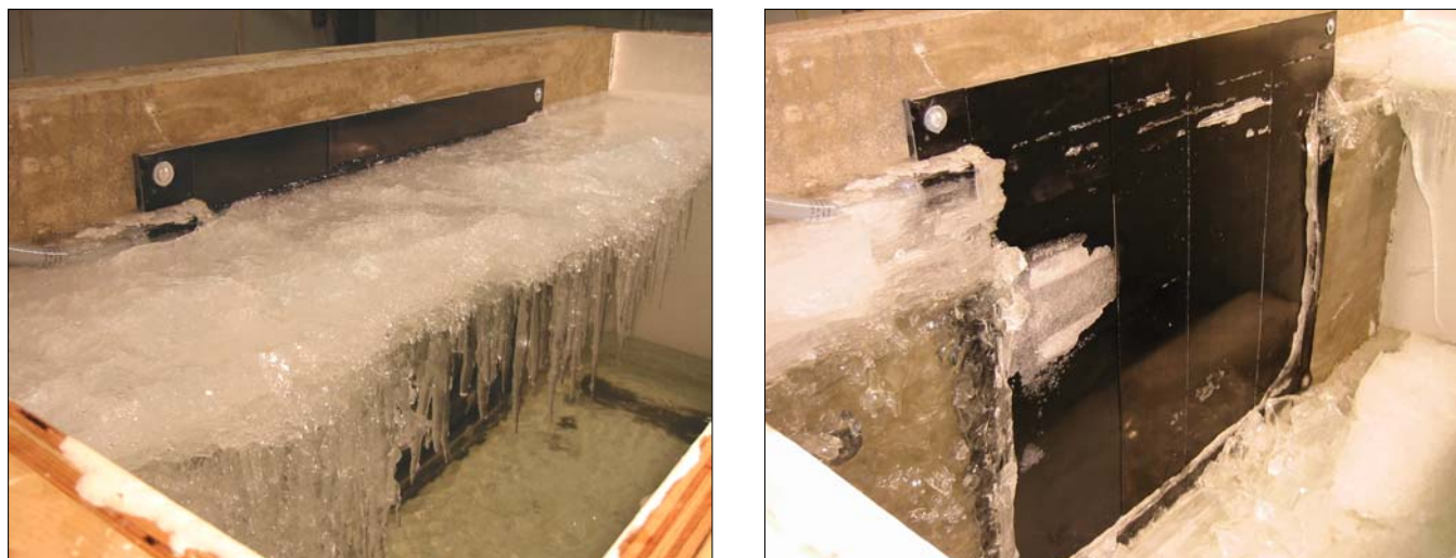
Figure 3. Shedding ice using electro-expulsive separation (EES). Initial ice collar on the EES panel (black) is shown at left, the panel clear of ice after four cycles is shown at right. The panel measures 1.2 m wide and 1.0 m tall.

The EES panel has been deployed at Lock and Dam 25 on the Mississippi River for field trials and evaluation during the winter of 2001–2002.