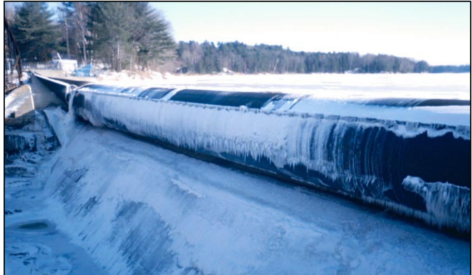
Figure 3. Highgate Falls Dam, fully inflated, 21 January 2000.

Although vandalism has not been a problem to date, Mosher believes that it would be difficult for anyone to cause a catastrophic failure. Bullet