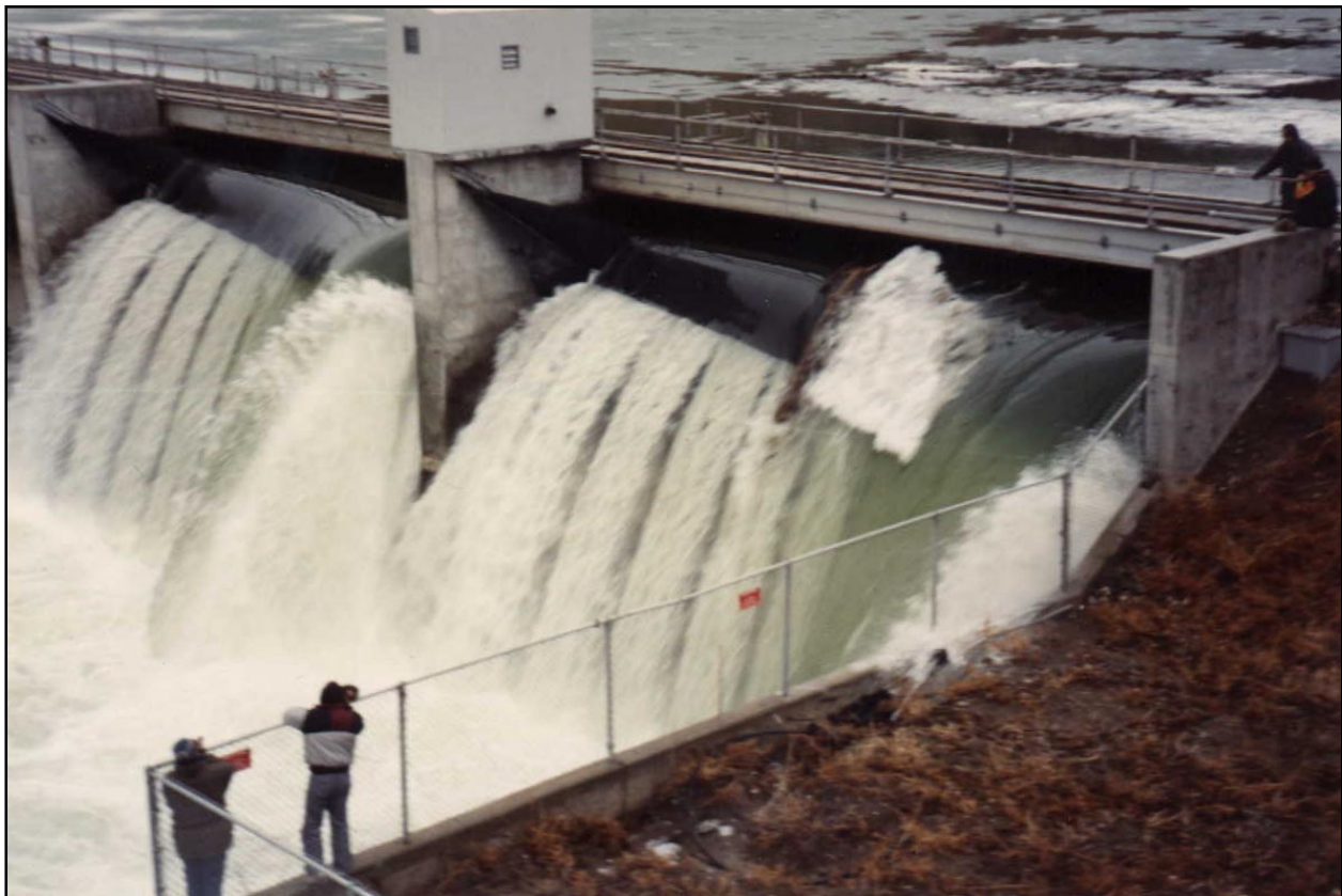
Figure 2. Ice and debris passing over Broadwater Dam on the Missouri River at Townsend, Montana. Note the vee notch in the airbag near the land-side bulkhead.

Some of the air bags leak in the crease areas near the concrete bulkheads. Also, leaks in the upstream and downstream faces of one airbag resulting from a high-powered rifle round were mended using a tubeless tire repair kit. Brian Carroll, who has been at the project since the installation of the inflatable dam, is very pleased with its performance.