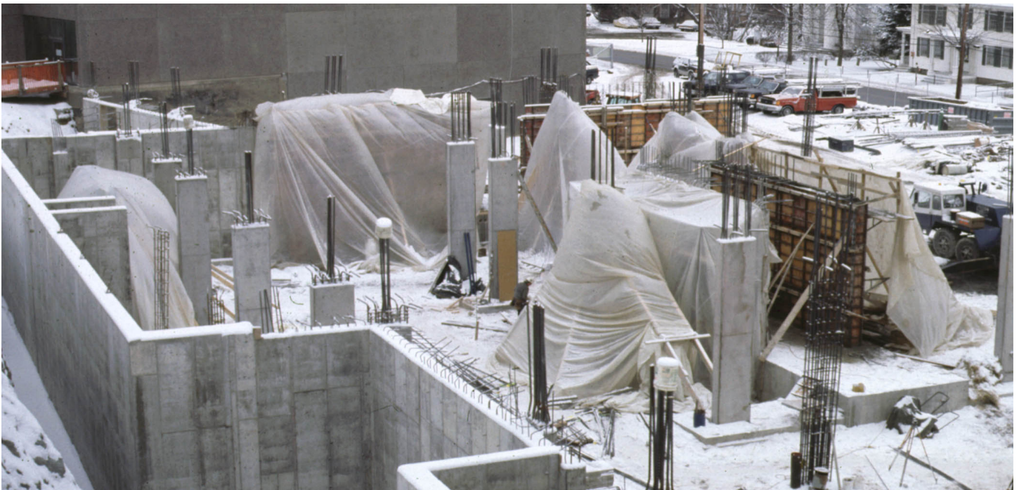
Figure 1. Typically, fresh concrete must be protected from the cold. Here, heat is supplied to the underside of plastic tenting.

Cold weather places serious constraints on today's concreting operations. As temperatures drop, concrete sets more slowly, takes longer to finish, and gains strength less rapidly. If temperatures dip too low, the risk is that the mix water will freeze, resulting in irreparable damage. To avoid difficulties, the American Concrete