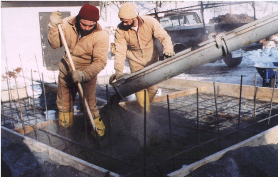
Figure 3. Working with cold-weather concrete presents no problems compared to conventional concrete. It is placed, consolidated, and finished in the usual manner. The only protection required is a plastic sheet to cover exposed areas to minimize moisture loss during curing.

to cure as rapidly as control concrete cured at 5°C (41°F). Arbitrarily, the initial setting of cold concrete was tentatively established to be not more than twice that of control concrete cured in standard laboratory conditions. This program, started at CRREL in April 2001, is scheduled to run three years. It is being funded by a consortium of Northern State Departments of Transportation and is being monitored by the Federal Highway Association.