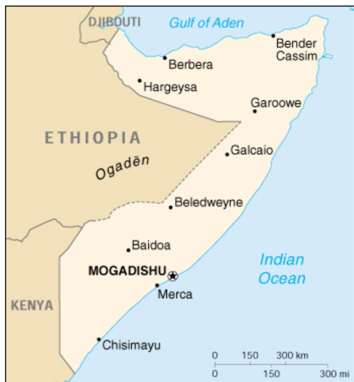
Figure (1) Map of Somalia 6

The hostile terrain and weather notwithstanding, Somalia occupies a strategically important location. The country's northern shores border on the Gulf of Aden, a potential choke point for the southern Red Sea and the vital sea-lanes that converge there. The eastern shores provide access to the Indian Ocean and the Arabian Sea. 7 Somalia's proximity to both the Arabian Gulf and the Red Sea played a key role in the western colonial and political interests throughout the nation's history.