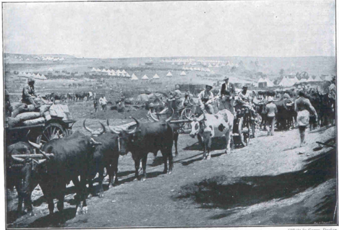
BREAKING CAMP: OX-WAGGONS MOVING OFF.