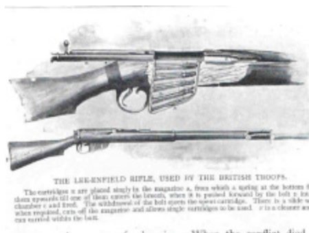
Lee – Enfield 99

had a distinct disadvantage. The British rifle required the loading of each round singly, as opposed to the Boer rifle that was loaded through a five round clip. In terms of rapidity of fire, both weapons being bolt action, the weapons were equal. It was in the reload interval that the difference became apparent.