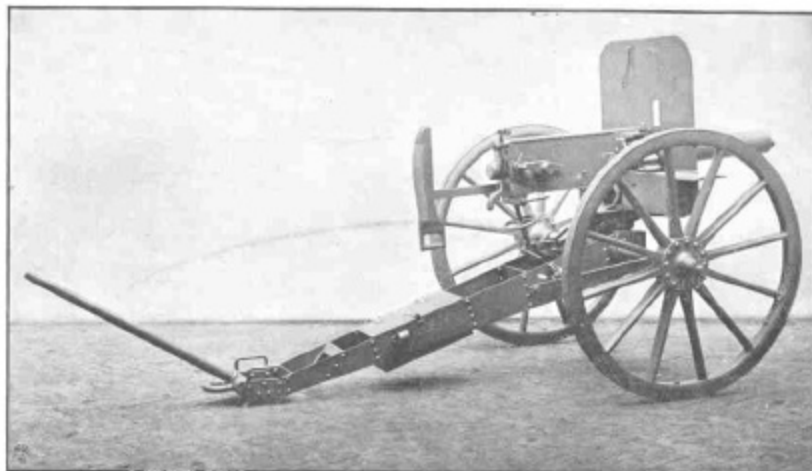
Vickers – Maxim 1.45 in. 74

This weapon was designed by the English for use by naval vessels but was not initially purchased. Bought by the Boeren, the Pom-Pom's capabilities were found to be well adapted for use on the veld 75 . The rapid rate of sustained fire this weapon had allowed the Boeren "... an extraordinarily demoralizing effect on the nerves, especially of the British infantry." 76 The lesson was not lost on the British Royal artillery and the weapon was eventually purchased and successfully fielded in South Africa 77 .