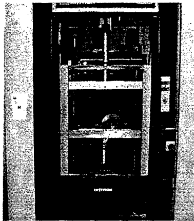
c) Displacement Control Fixture