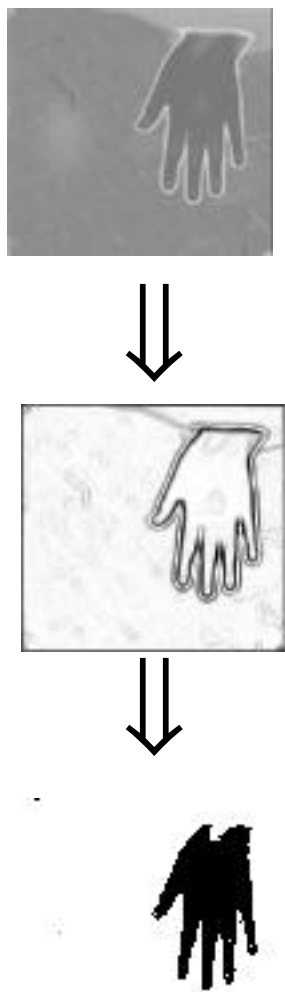
Fig2 the process of contour pick-up of model infrared image of palm .

The subsequent pictures show the process of contour extraction and images registration. After extract the contour from environment, we filled inside the edge with darkness. Here we use a single palm to show the principle of this thesis. All the infrared images of palms can be registered similarly.