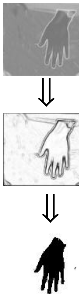
Figure3: the infrared image of palm to be registered

When using the same method on the image to be registered, we attained the following pictures.