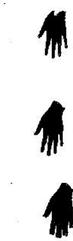
Fig.4 the results of registered palms