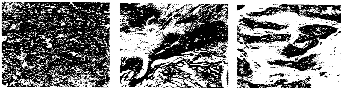
Figure 2. EBER-1 in situ hybridization in positive control and breast cancer sections. (A) shows strong nuclear staining in a control with posttransplant lymphoproliferative disorder. (B) Case #20 shows nuclear positivity in the infiltrated lymphocytes. (C) Positive staining was detected in focal tumor cells (case # 17R).