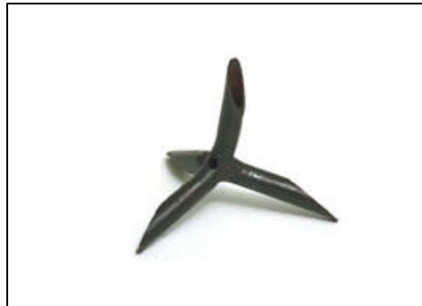
FIGURE 1 THE CALTROP

One of the first recorded non-explosive landmines is the “caltrop”. The caltrop consists of four metal spikes joined together at the center. The caltrop is simply thrown onto the ground - three of the spikes form the base resting on the ground and the fourth protrudes upward. Regardless of how the device is thrown, one of the spikes will always point upward. Caltrops are still used today in various forms and sizes. Large caltrop-like devices, known as tetrahedrons, still litter many beaches along the northeastern coast of the Republic of Korea. The figure below depicts an early model caltrop.