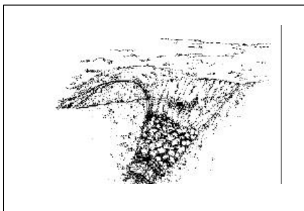
FIGURE 2 THE FOUGASSE MINE

The earliest pressure-operated mines date back to the mid-1700s. The Germans developed a ceramic container filled with glass and metal fragments embedded in a clay substance that contained roughly two pounds of gunpowder. The device, known as a “fladdermine,” was activated by someone stepping on it. A small plunger placed into the device, when depressed, ignited the gunpowder, which in turn expelled the debris into the air, killing or maiming its victim. Later versions of the fladdermine contained tripwires, which when disturbed, ignited the gunpowder. The Russians improved the use of mines in the 1820s, when they developed the electric detonation system. The system simply incorporated an electrical current, carried by concealed wires, to detonate gunpowder. 4 Today’s conventional mines are not much different. Plastic explosives and plastic containers replace gunpowder and ceramic jars, but the device itself remains largely the same. The most significant change in today’s mine is not the mine itself, but, the initiating mechanism. Today’s mines can be initiated remotely via an electronic signal (command detonated), or by pre-set times begun upon mine emplacement. These modern initiation systems are discussed below.