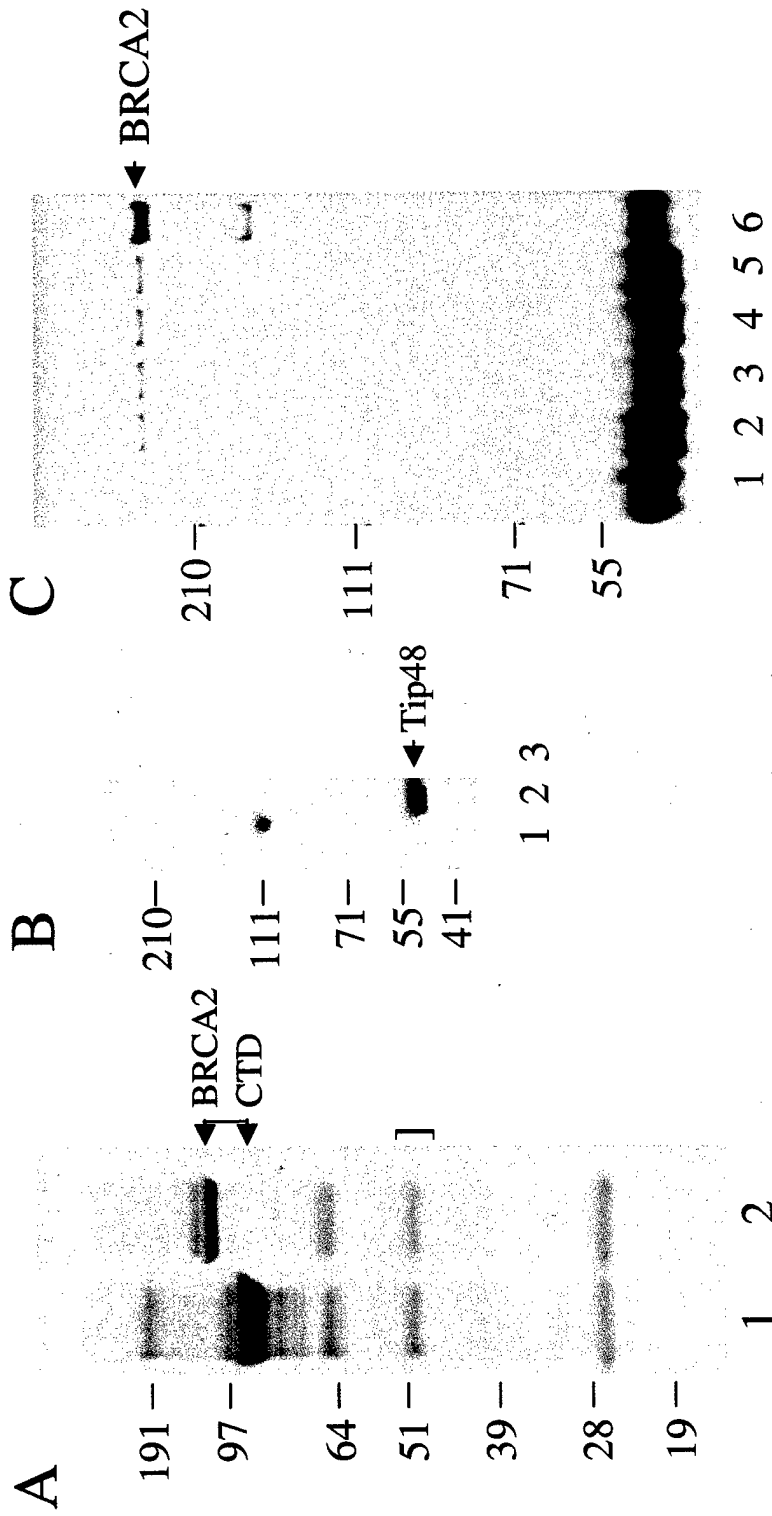
Figure 3. BRCA2 interacts with Tip48. (A) Coomassie Blue staining of components of BRCA2 C-terminal domain (CTD) complexes purified using a double-tagging (FLAG and HA) method. Lane 1 and 2, components of complexes of BRCA2 CTD tagged either at the N-terminus (lane 2) or at the C-terminus (lane 3). (B) BRCA2 CTD interacts with Tip48. Materials bound on anti-FLAG M2 agarose from lysate of control HeLa cells (lane 1) and cells stably expressing BRCA2 CTD double-tagged at the C-terminus (lane 2) were eluted using FLAG peptide, resolved by SDS-PAGE and blotted onto a nitrocellulose membrane and probed with an anti-Tip48 polyclonal antibody. (C) Coimmunoprecipitation of endogenous BRCA2 and Tip48. Whole cell extract of 293 cells was immunoprecipitated with preimmune serum (lane 1), sera from four different anti-Tip48 bleeds (lanes 2 through 5) and anti-BRCA2F2 (lane 6). BRCA2 in the precipitates was detected with a monoclonal antibody (Ab-1, Oncogen Research Products).